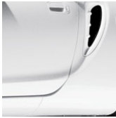
Super White with Black fabric or Tan leather interior