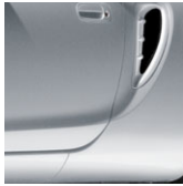
Liquid Silver Mica with Gray or Black fabric or Black leather interior