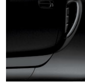
Black with Gray or Black fabric or Black leather interior