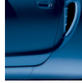
Spectra Blue Mica with Black fabric or Black leather interior