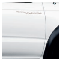
Natural White 2, 3 with Gray or Oak Interior