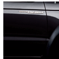
Black Sand Pearl 2 with Gray or Oak Interior