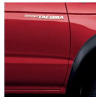
Cardinal Red 1, 2, 3 with Gray or Oak Interior