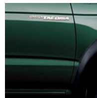
Imperial Jade Mica 2 with Gray or Oak Interior