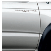
Lunar Mist Metallic 1, 2 with Gray Interior