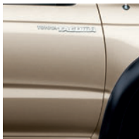
Sierra Beige Metallic 2, 3 with Oak Interior