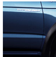
Horizon Blue Metallic 1, 2, 3 with Gray Interior