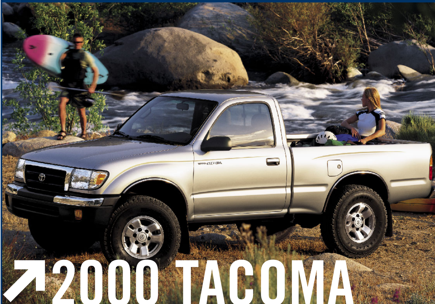
PreRunner in Lunar Mist Metallic with available Value Edition Plus Package.