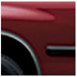
Autumn Red Mica with Oak Interior 3