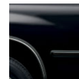
Black with Gray, Oak or Light Charcoal Interior 1

1 Oak only on Base model and with available Limited Leather Trim Package.