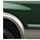
2-Tone Imperial Jade Mica/Thunder Gray Metallic with Oak Interior 5