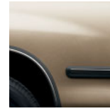
Golden Sand Metallic with Oak Interior 3