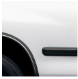
Natural White with Gray, Oak or Light Charcoal Interior 1