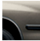
Thunder Gray Metallic with Oak or Light Charcoal Interior 1