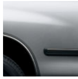
Platinum Metallic with Gray Interior 2,3