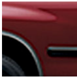
Sunfire Red Pearl with Oak or Light Charcoal Interior 1