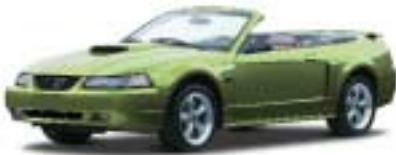
Electric Green Clearcoat Metallic

Vehicles shown may include optional equipment.