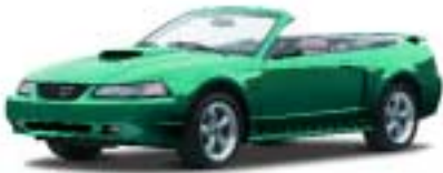
Tropic Green Clearcoat Metallic