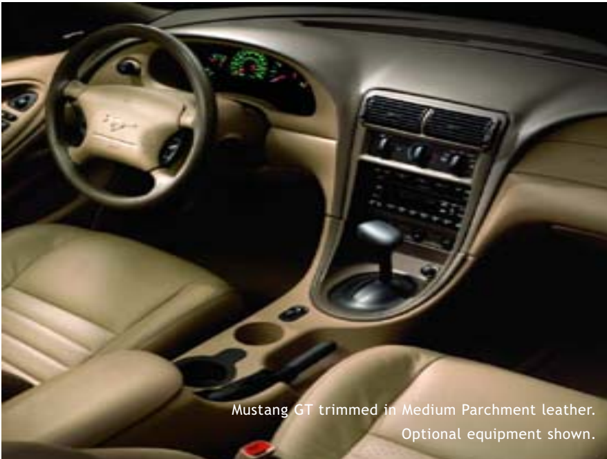
Mustang GT trimmed in Medium Parchment leather. Optional equipment shown.

In addition to these features, you can add the following option: • Leather-Trimmed Front Bucket Seats (standard on convertible)