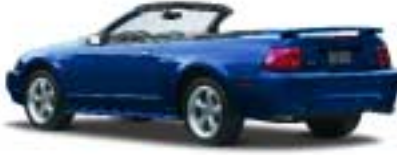
True Blue Clearcoat Metallic