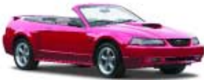
Performance Red Clearcoat