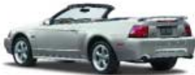
Silver Clearcoat Metallic