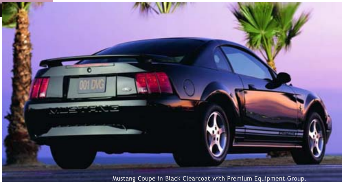
Mustang Coupe in Black Clearcoat with Premium Equipment Group.

Open road. Open top. Open throttle. There's a definite pattern here with the Mustang GT. And we like it. A lot. Shown in Performance Red Clearcoat.