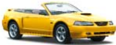
Zinc Yellow Clearcoat