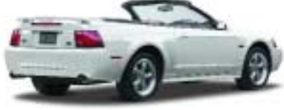
Oxford White Clearcoat