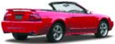
Laser Red Tinted Clearcoat Metallic