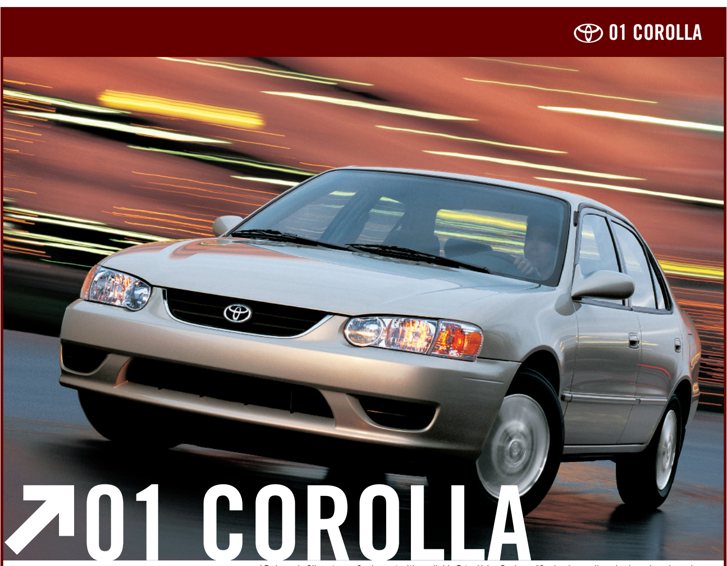
LE shown in Silverstream Opalescent with available Extra Value Package #2, aluminum alloy wheels and mudguards.