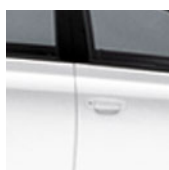
POLAR WHITE with Shadow Gray or Warm Gray Interior