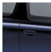
INDIGO INK PEARL with Shadow Gray or Warm Gray Interior