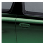
ELECTRIC GREEN MICA with Shadow Gray or Warm Gray Interior