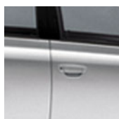
ALPINE SILVER METALLIC with Shadow Gray or Warm Gray Interior