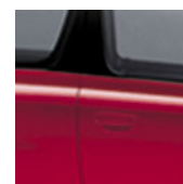
ABSOLUTELY RED with Shadow Gray Interior