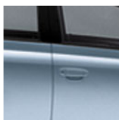
SEAFOAM BLUE METALLIC with Shadow Gray Interior