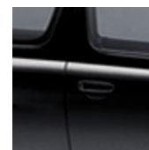
BLACK SAND PEARL with Shadow Gray or Warm Gray Interior