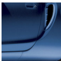
Spectra Blue Mica with Black cloth interior