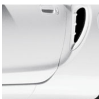
Super White with Black or Red cloth or Tan leather interior