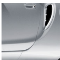
Liquid Silver Metallic with Black or Red cloth or Tan leather interior