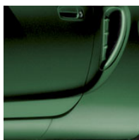
Electric Green Mica with Tan leather interior