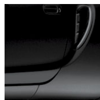
Black with Black or Red cloth or Tan leather interior

*See Specifications page for more information on Toyota's Supplemental Restraint System (SRS).