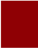
ABSOLUTELY RED 3P0