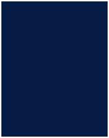
INDIGO INK PEARL 8P4