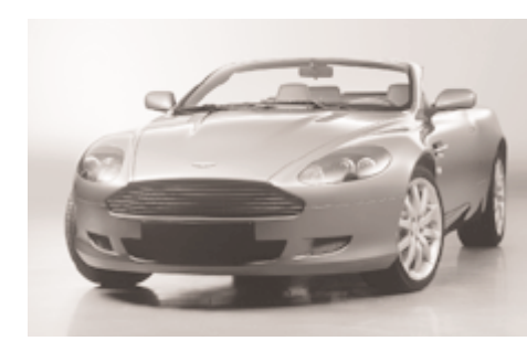
The elegant DB9 Volante

The body frame is the most structurally efficient in the world, taking into account strength, torsional rigidity and weight. It has double the rigidity of many rivals, as well as being lighter, resulting in superior handling and agility.