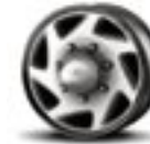
16" Full Sport Wheel Cover