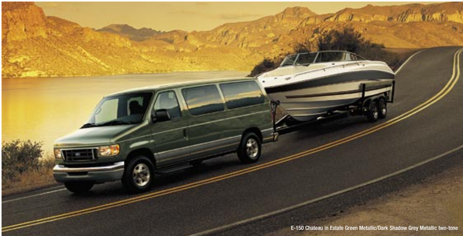
E-150 Chateau in Estate Green Metallic/Dark Shadow Grey Metallic two-tone

But there's more to being a Ford owner than just driving a great vehicle. There are perks like the My Ford owner website where you can manage all of your vehicle information in one place. Register today at www.fordvehicles.com . Come in for a test-drive today and discover the versatility of Built Ford Tough.