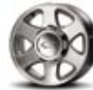
16" Aluminum Wheel