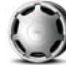
16" Full Wheel Cover