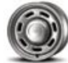
16" Argent Styled Steel Wheel

•Includes Full-Length XLT Carpeting, XLT Side Door Trim Panels, Cloth Bucket Seats, Illuminated Entry, Headlamps-On Alert Chime, Carpeted Floor Mats and Insulation Package (Requires Power Locks/Windows) ••Includes Chrome Bumpers, Chrome Grille Surround, Aerodynamic Halogen Headlamps and 16" Full Wheel Covers (4)