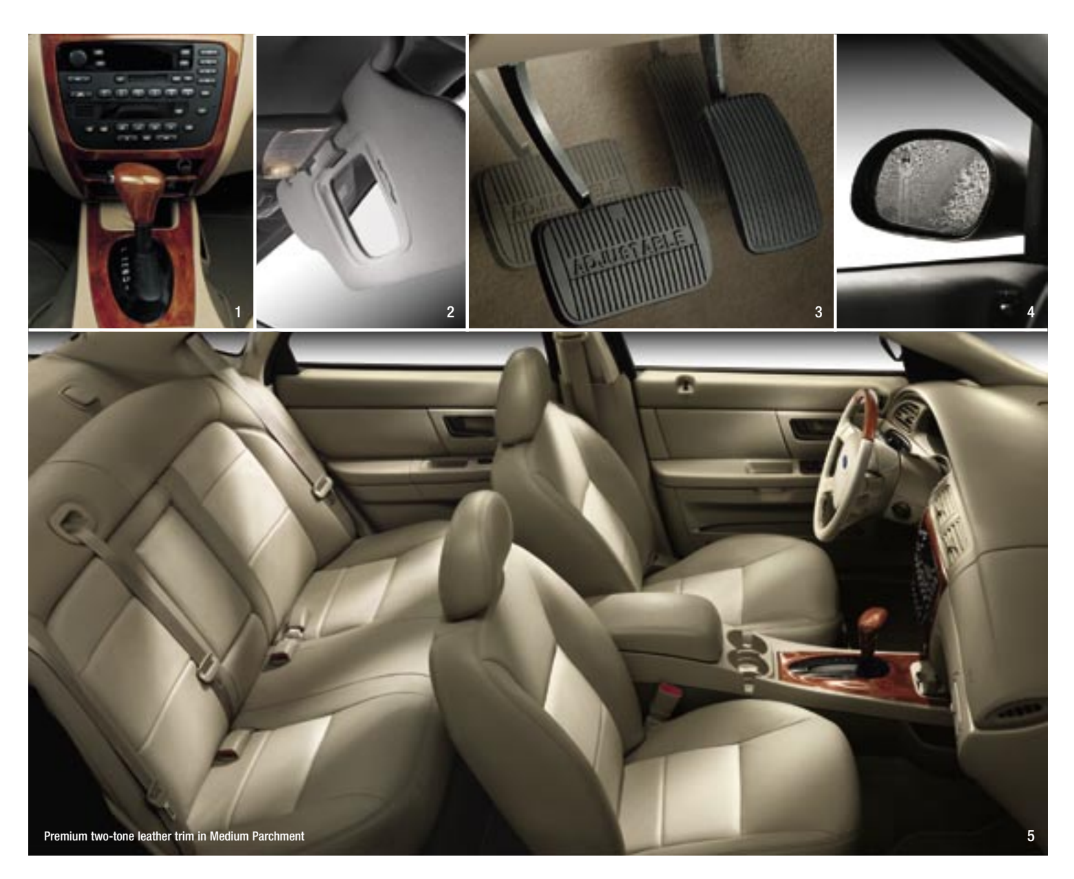
1 The available Wood Package on Taurus SES/SEL adds woodgrain accents throughout. 2 Dual illuminated visor vanity mirrors come standard on SES and SEL. 3 Available power adjustable accelerator and brake pedals allow you to find the most comfortable position for your height. 4 Heated sideview mirrors, part of the optional Luxury and Convenience