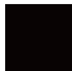
Black with Ash or Ivory interior