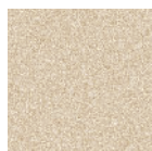
Sonora Gold Pearl with Ivory interior