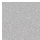
Millennium Silver Metallic with Ash interior