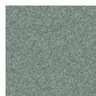
Oasis Green Pearl with Ash or Ivory interior