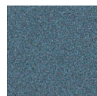
Bluestone Metallic with Ash or Ivory interior