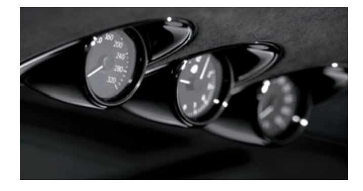
Speed, time, outside temperature. The three attractive control instruments for the rear passengers are found in every Maybach – in the Maybach 57 S the surround and mounting are finished in black piano lacquer

To allow all occupants to enjoy their own individual preferred temperature at all times, the Maybach 57 S features two air-conditioning systems with a total of four climate zones. The system for the front section of the passenger compartment and the second system for the rear operate independently of one another and can be regulated separately. The generous dimensions of the system allow unique climate comfort with extremely fast response times. The temperature, blower speed and air distribution settings can be programmed individually for each passenger. A specially designed