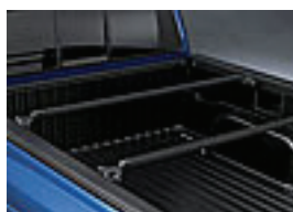
Cargo Cross Bars