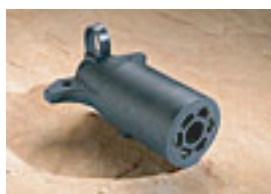
7-Pin to 4-Pin Adaptor