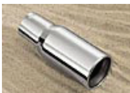
Exhaust Tip by Valor