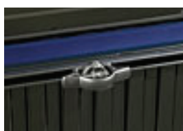
Cleat Tie Down