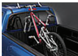
Fork Mount Bike Attachment