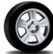
16" 5-Spoke Aluminum Standard on 3-door SES, 4-door SES and 5-door SES