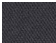
Charcoal Cloth Standard on 3-door S and 5-door S