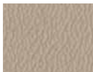
Light Pebble Leather Trim Available on 4-door SES and wagon SES