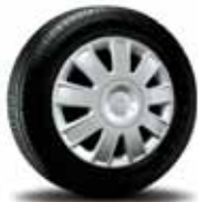
15" Steel with 9-Spoke Wheel Cover Standard on 3-door S, 4-door S and 5-door S