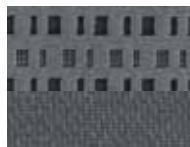
Light Flint Cloth Standard on 4-door SE and SES, and wagon SE and SES