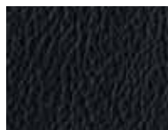
Charcoal Leather Trim Available on 3-door SES and 5-door SES