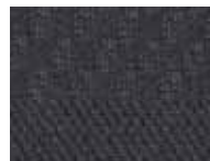
Charcoal Cloth Standard on 3-door SE and SES, and 5-door SE and SES