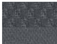
Light Flint Cloth Standard on 3-door SE and SES, and 5-door SE and SES