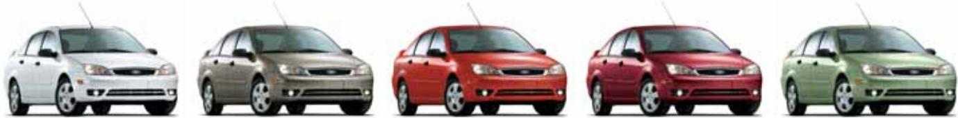
Cloud 9 White