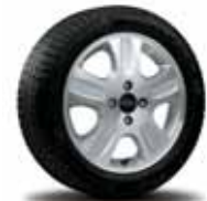
16" 5-Spoke Machined-Aluminum Standard on 4-door ST