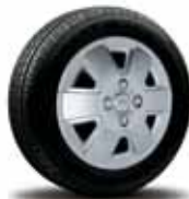
15" Steel with 6-Spoke Wheel Cover Standard on 3-door SE, 4-door SE, 5-door SE and wagon SE