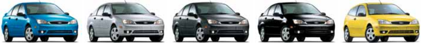
Aqua Blue Metallic