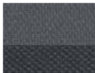
Light Flint Cloth Standard on 3-door S, 4-door S and 5-door S