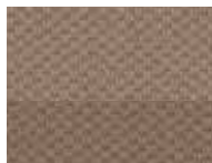
Pebble Cloth Standard on 4-door S and 5-door S