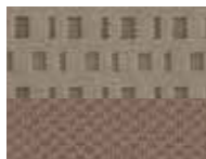
Light Pebble Cloth Standard on 4-door SE and SES, and wagon SE and SES