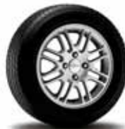
15" Multi-Spoke Aluminum Standard on wagon SES; Optional on S and SE and included with optional SE Sport Group