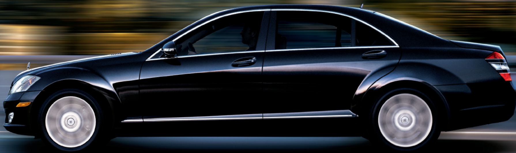
S550 shown in Black.

The Mercedes-Benz S-Class has long been known for its peerless combination of elegance, performance and craftsmanship. Now in its ninth generation, the all-new S-Class is larger inside and out, with greater luxury and presence than ever before. A more powerful V-8 engine, industry-leading technology and some of the most sophisticated automotive safety systems in production today reassert the S-Class's reputation as the foremost luxury sedan in the world. The all-new 2007 S-Class.