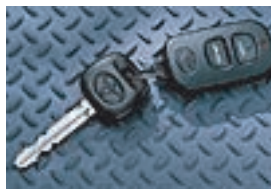
VIP Security System RS3200 Plus - $359.00