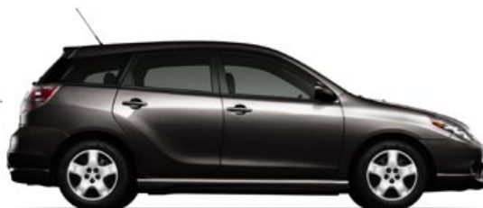
XR 2WD 4-Speed Automatic (1912) MSRP** Starting At: $17,570.00