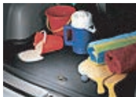
Xtreme Cargo Mat $79.00