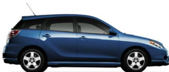
XR 2WD 5-Speed Manual (1911) MSRP** Starting At: $16,740.00