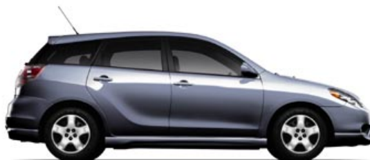
2WD 4-Speed Automatic (1902) MSRP** Starting At: $16,060.00