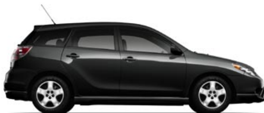
2WD 5-Speed Manual (1901) MSRP** Starting At: $15,260.00