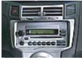
AM/FM/CD Player Base Grade (S, LB) $445.00