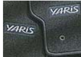
Carpet Floor Mats (S, LB) 5-piece set $150.00