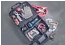
Emergency Assistance Kit (S, LB) $70.00