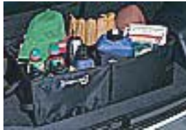
Cargo Tote (S, LB) $40.00