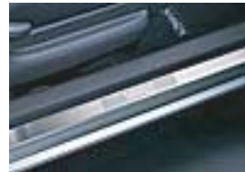
Door Sill Enhancement S - $95.00 LB - $159.00