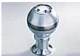
Sport Shifter Knob (S, LB) $65.00