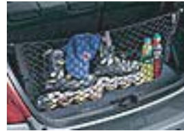
Cargo Net (S, LB) $49.00