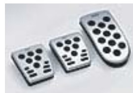
Sport Pedal Covers (S, LB) Automatic - $82.00 Manual - $92.00