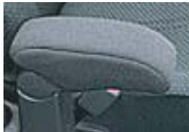
Center Arm Rest (LB) $129.00