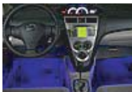
Interior Light Kit - Blue (S, LB) $275.00