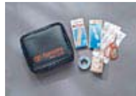
First Aid Kit (S, LB) $29.00