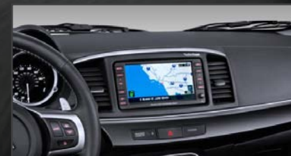
40GB Navigation System with Music Server & Real-Time Traffic