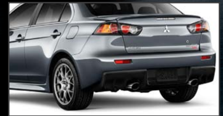
Available Eibach® and BILSTEIN® Suspension