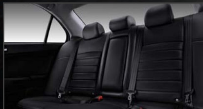
RECARO® Sport Seats