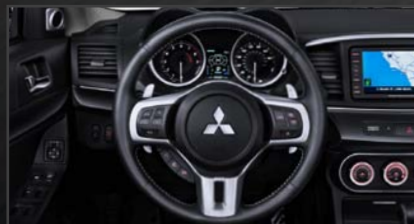
FUSE Hands-Free Link System™