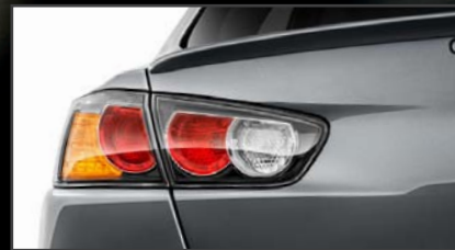
Brembo® Braking System