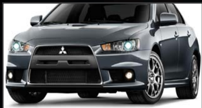
Super All-Wheel Control (S-AWC)