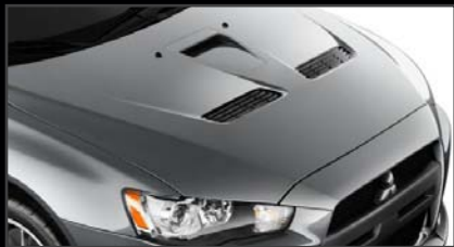
291-hp Intercooled MIVEC Turbo Engine