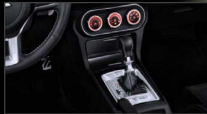
Available Twin Clutch SST