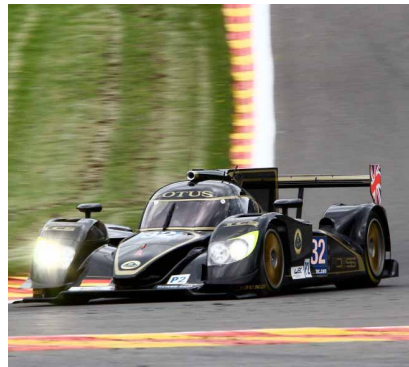
Left: Evora GT4 Below: LMP2 Car Bottom: 2012 MSA British Endurance Championship winning Evora GTC Right: Lotus F1® Team Cars at the 2013 German Grand Prix

As ambitious now as in the past, this dedication to motorsport continues with Lotus gearing up in competitions around the world. In Formula 1<sup>®</sup>, Endurance racing and numerous GT series, Lotus is up to speed; from Silverstone to Le Mans to Laguna Seca, Lotus is making an impression in the world's most famous events on the most demanding circuits. These high-profile international events are complimented by dedicated Lotus one-make race series for the Evora, Exige and Elise.