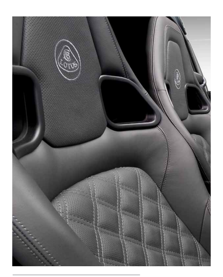
Premium Pack Roadster interior

The Lotus Exige S Roadster combines the pure performance of its coupé twin with the unique open air driving experience loved in the Elise. Its new, sleeker body design, with its sculptured, leaner shape allows it to safely shed its aerodynamic aids in order to maximise airflow with the roof off. It's the first Exige offered with a factory-fitted soft top, one which is typically lightweight and easy to install and remove.