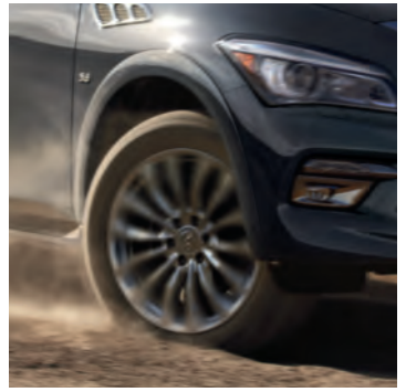
STABLE CORNERING Enhance your abilities with the Hydraulic Body Motion Control system. By minimizing body lean, the ride feels smoother, more comfortable.