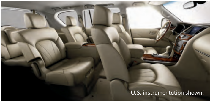
LUXURY, COMFORT AND SECURITY Indulge your senses—the natural softness of semi-aniline leather and the visual reward of Stratford Burl trim. This is luxury created to move up to 8 passengers<sup>1</sup> with available security inspired by the INFINITI Safety Shield® philosophy.