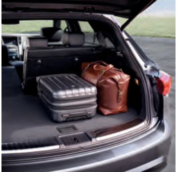
SIMPLIFIED ENTRY Automatically open the power rear liftgate from the liftgate handle, lower dash or Intelligent Key for easy direct access.