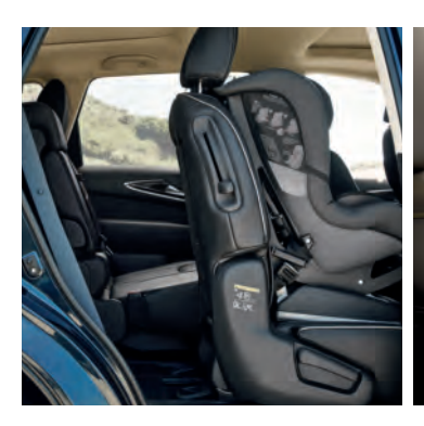
THREE ROWS OF FLEXIBILITY Adjust to the needs of every passenger and offer a unique second-row seat that tilts and slides with a child seat in place.<sup>11</sup>