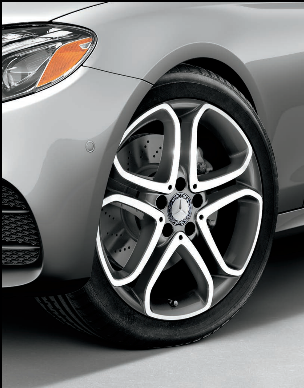
APPEARANCE ALLOY WHEELS