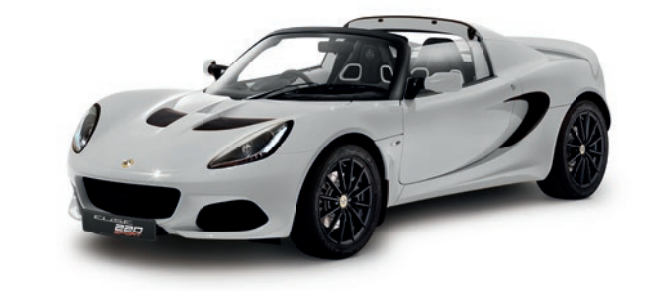
METALLIC SILVER C190