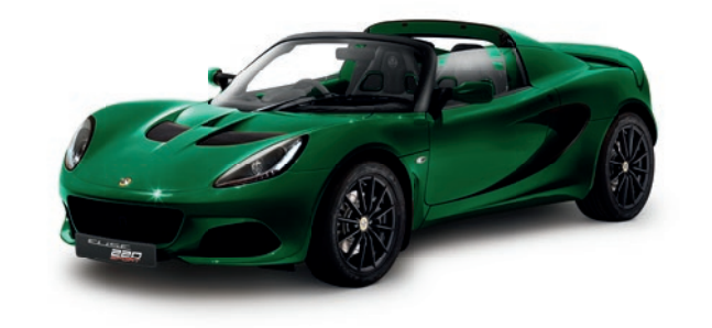
RACING GREEN C203