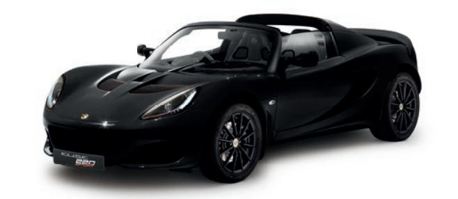
METALLIC BLACK C186