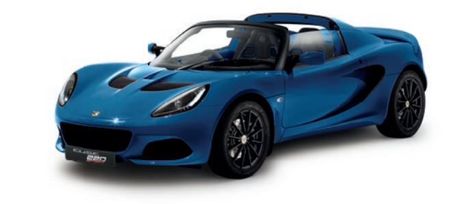
METALLIC BLUE C202