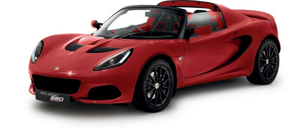
SOLID RED C183