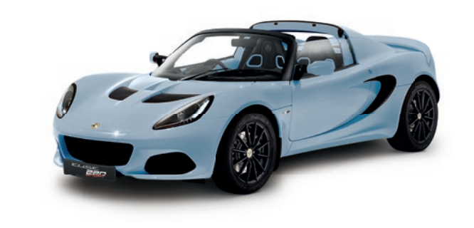
METALLIC LIGHT BLUE C208