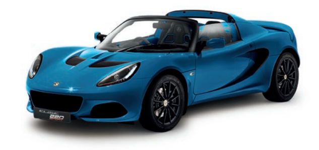
ELISE BLUE C214

Images are for comparison use only, please speak to your local dealer for physical print samples.