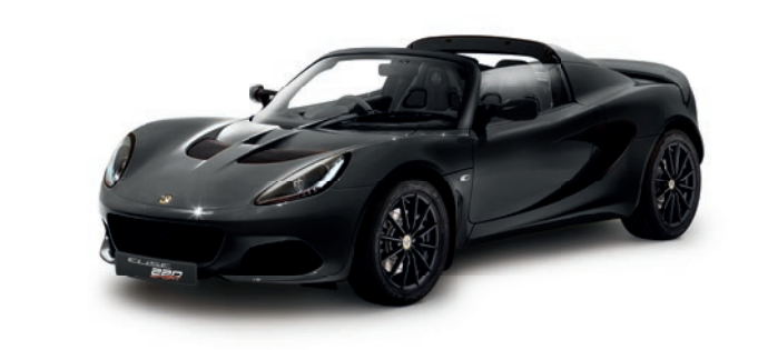
METALLIC DARK GREY C213