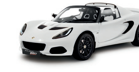
METALLIC WHITE C201