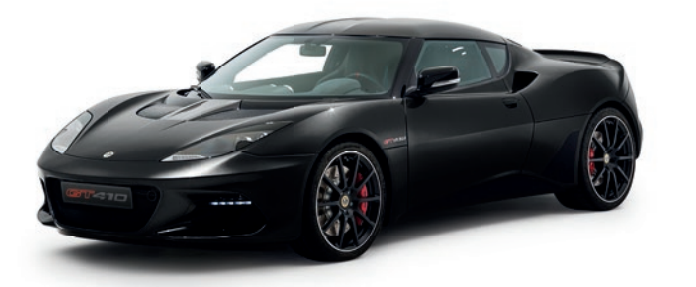
METALLIC DARK GREY C213

Images are for comparison use only, please speak to your local dealer for physical print samples.