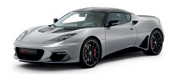
EVORA SILVER C180