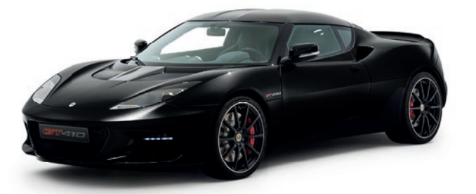
METALLIC BLACK C186