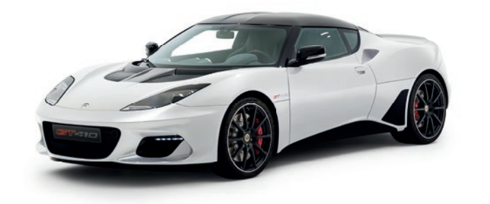
METALLIC WHITE C201