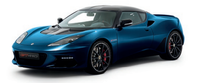
METALLIC BLUE C202