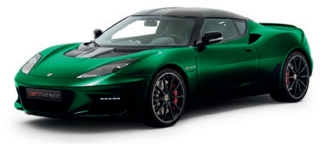
RACING GREEN C203