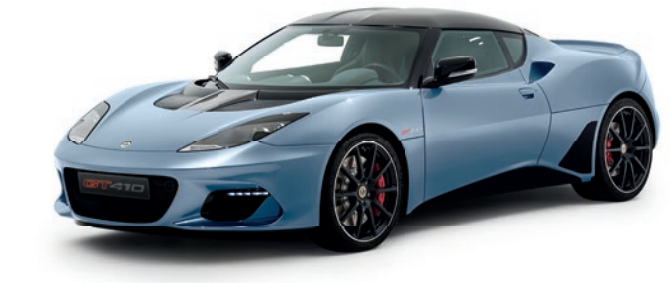
METALLIC LIGHT BLUE C208