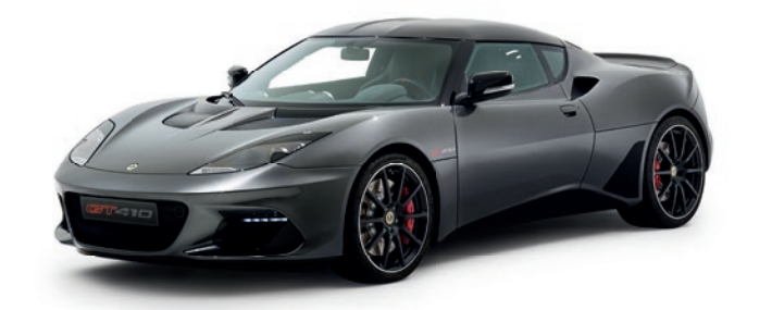
METALLIC GREY C185