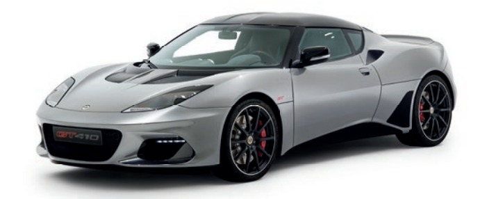
METALLIC SILVER C190