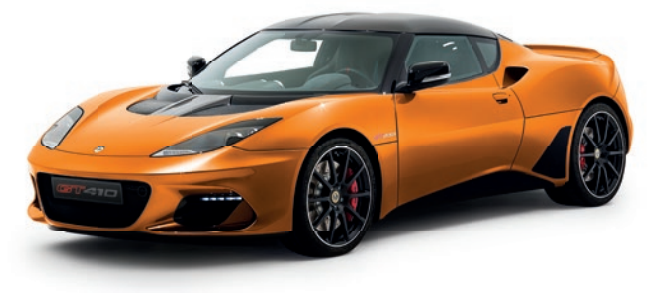
METALLIC ORANGE C205