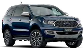
Deep Crystal Blue ~