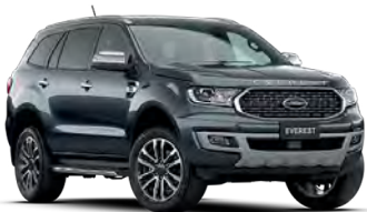
Meteor Grey ~