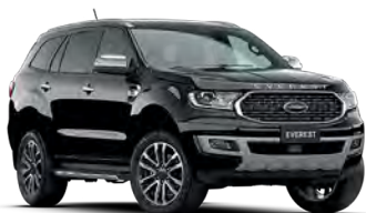
Shadow Black ~