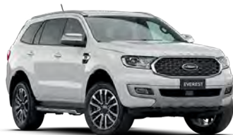
Alabaster White ~

~Prestige Paint is an option that incurs an additional charge ^Available on all models except Sport