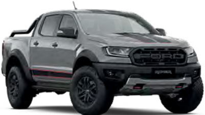
Conquer Grey 3