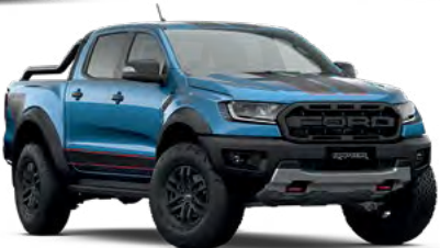
Ford Performance Blue 3