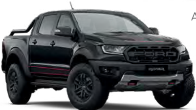
Shadow Black 3