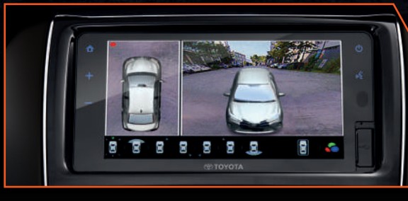
3D Panoramic View Monitor (PVM) Get a detailed 360° view of your vehicle for manoeuvring in tight spaces.