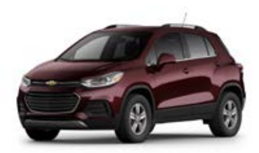
Black Cherry Metallic