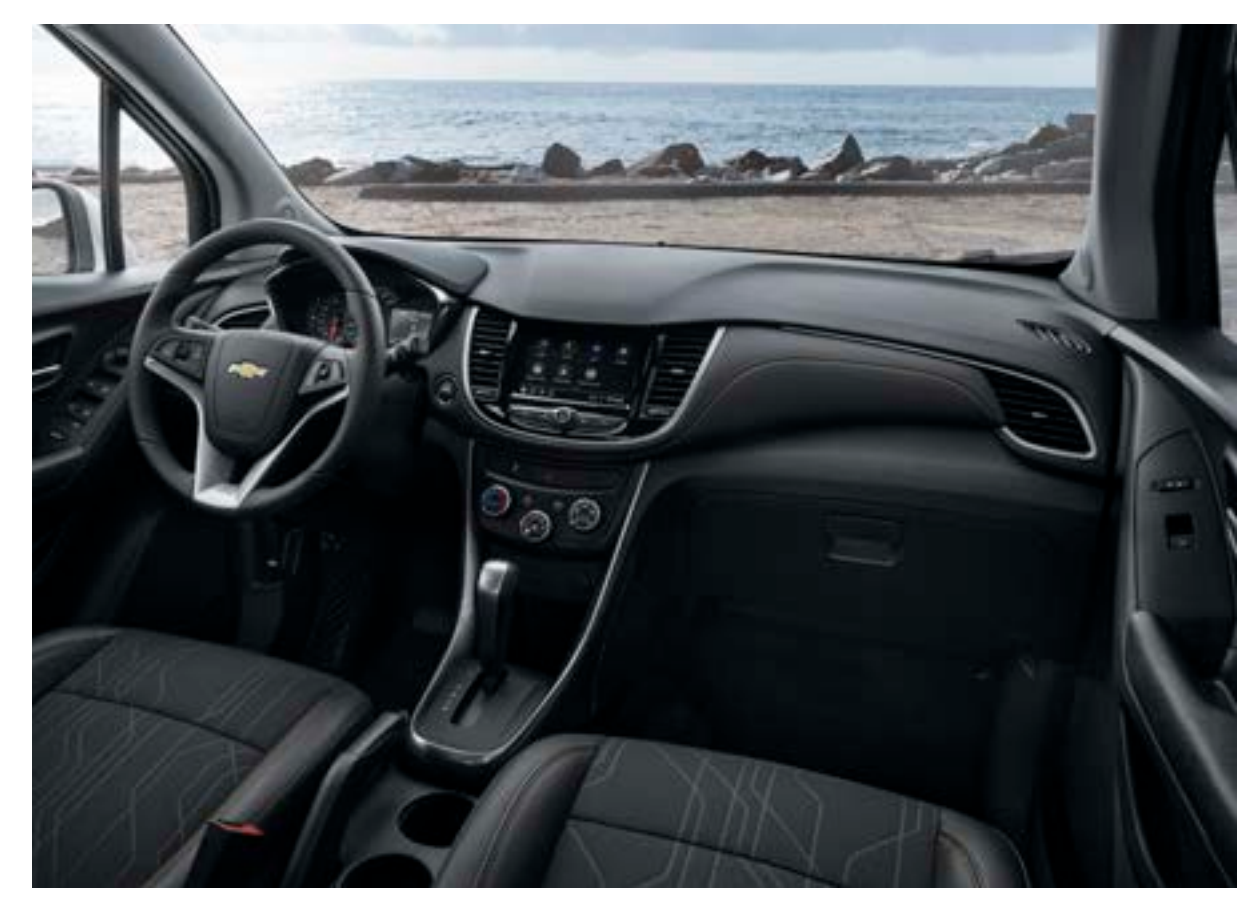
Trax LT interior in Jet Black with available features.

Compact dimensions and maneuverability make it ideal for slipping in and out of tight parking spaces or navigating narrow streets. The new 1.4L Turbo engine offers more horsepower and torque than the previous powerplant. Inside, there's plenty of room for you and four friends. Or take advantage of the fold-flat rear seats when you want to bring some cargo along. Put it all together for a small SUV that's large enough for you to live your biggest life.