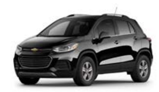
Mosaic Black Metallic