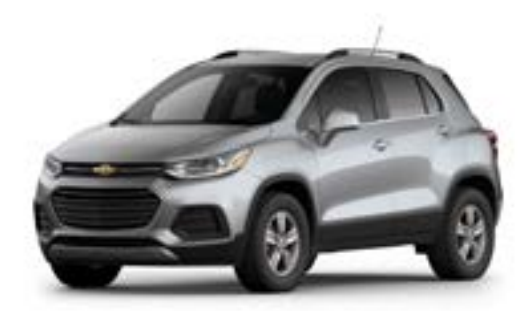
Silver Ice Metallic