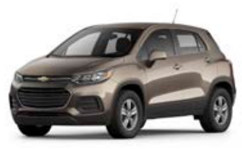
Stone Gray Metallic