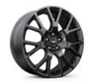
18" Gloss Black Aluminum Wheels Available on LT with Midnight Edition or Sport Edition

1 Chevrolet Infotainment System functionality varies by model. Full functionality requires compatible Bluetooth and smartphone, and USB connectivity for some devices. 2 Requires available Premium Seat Package.