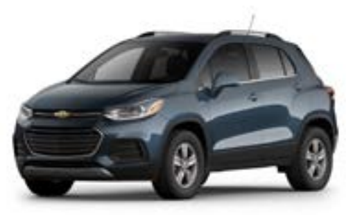
Shadow Gray Metallic