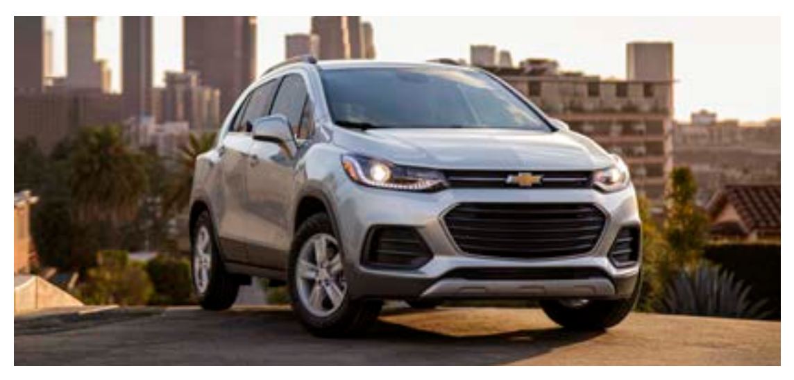
Trax LT in Silver Ice Metallic.

1 EPA-estimated 24 MPG city/32 highway (FWD). EPA-estimated 23 MPG city/30 highway (AWD). 2 Cargo and load capacity limited by weight and distribution. 3 Vehicle user interface is a product of Apple and its terms and privacy statements apply. Requires compatible iPhone and data plan rates apply. 4 Vehicle user interface is a product of Google and its terms and privacy statements apply. Requires the Android Auto app on Google Play and a compatible Android smartphone. Data plan rates apply. You can check which smartphones are compatible at g.co/androidauto/requirements. 5 Service varies with conditions and location. Requires active service and paid AT&T data plan. Visit onstar.com for details and limitations. 6 A NOTE ON CHILD SAFETY: Always use seat belts and the correct child restraint for your child's age and size, even with airbags. Even in vehicles equipped with the Passenger Sensing System, children are safer when properly secured in a rear seat in the appropriate infant, child or booster seat. Never place a rear-facing infant restraint in the front seat of any vehicle equipped with an active frontal airbag. See your vehicle Owner's Manual and the child safety seat instructions for more safety information. 7 2015–2022 model years. Government 5-Star Safety Ratings are part of the National Highway Traffic Safety Administration's (NHTSA's) New Car Assessment Program (www.nhtsa.gov).