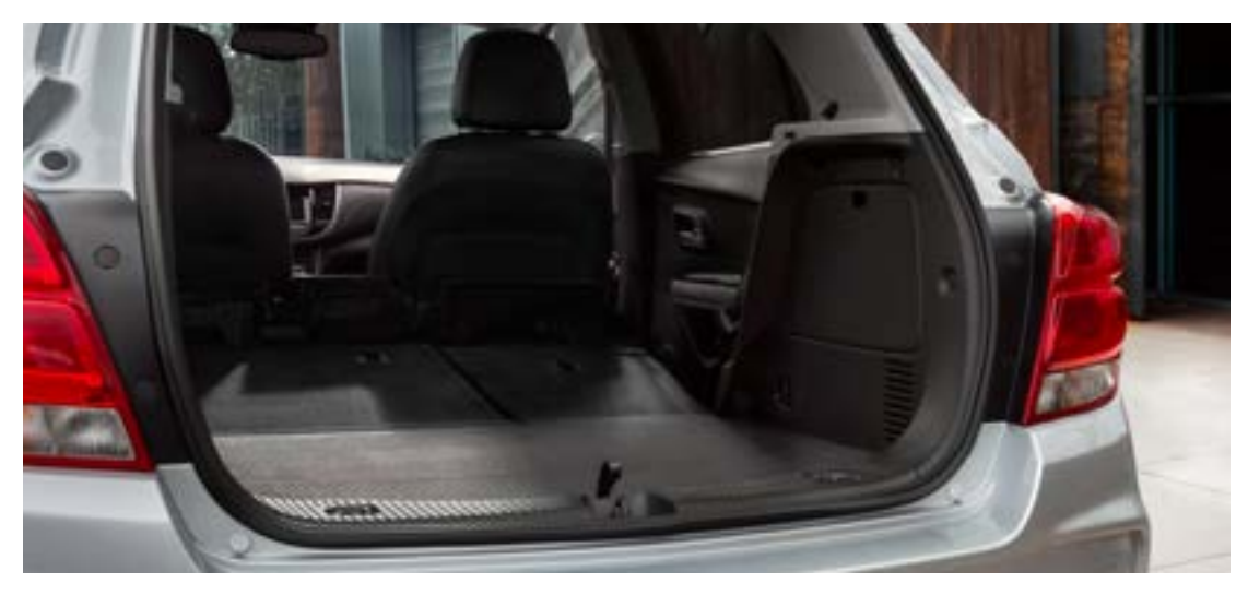
48.4 cubic feet of maximum cargo space?