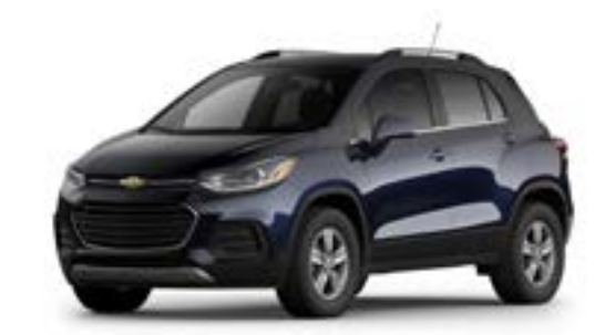
Midnight Blue Metallic