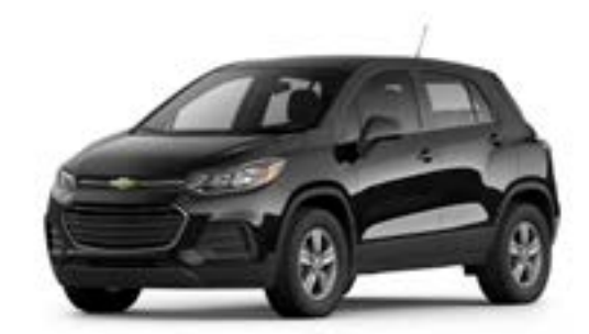
Mosaic Black Metallic