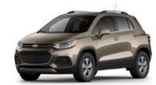
Stone Gray Metallic