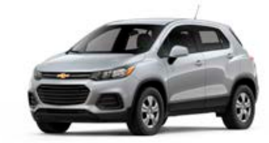
Silver Ice Metallic