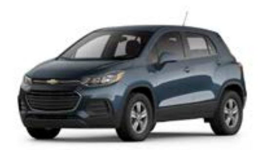
Shadow Gray Metallic