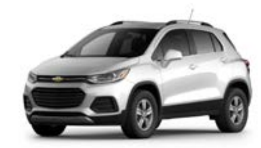
Iridescent Pearl Tricoat<sup>1</sup>