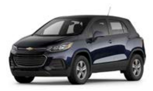
Midnight Blue Metallic