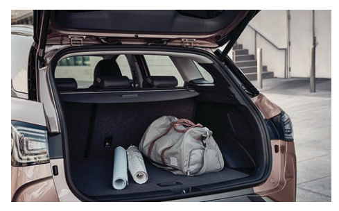
Hands-free smart liftgate with height adjustment