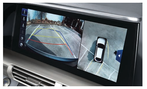
Surround View Monitor with Parking Guidance