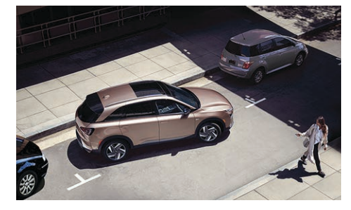
Remote Smart Parking Assist