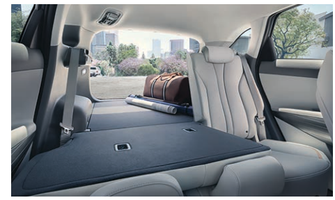
60/40 split-folding 2nd-row seats