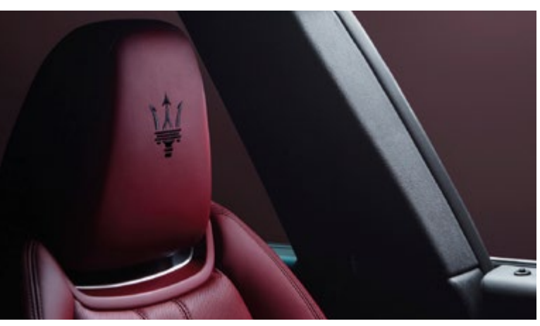
Levante - Headrest detail