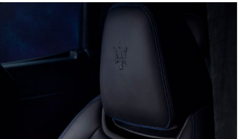
Levante GT Hybrid - Headrest detail