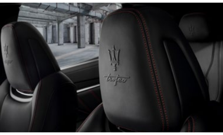
Levante Trofeo - Headrest detail