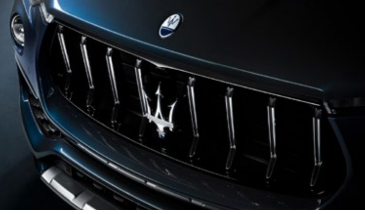
Levante GT Hybrid - Grille