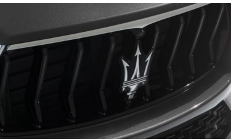
Levante - Grille