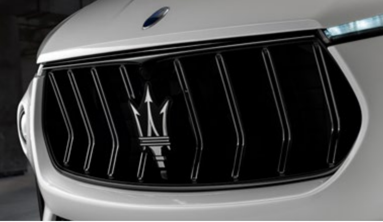
Levante Trofeo - Grille