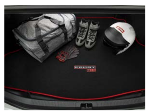
TRD carpet trunk mat