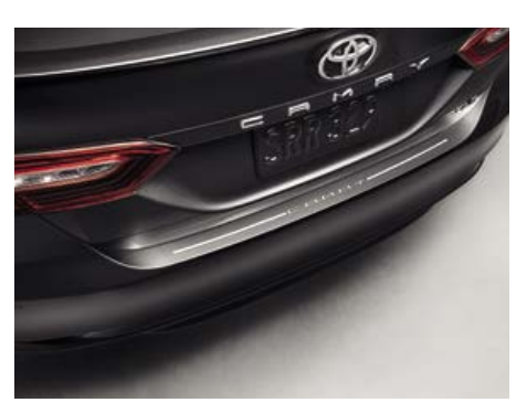
Rear bumper appliqué