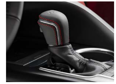
TRD shift knob