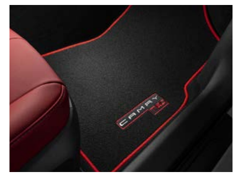
TRD carpet floor mats<sup>40</sup>