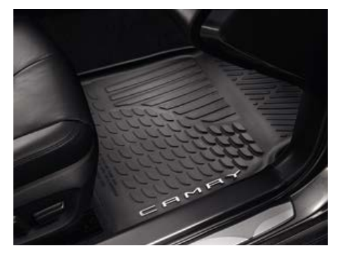
All-weather floor liners<sup>40</sup>

This is a great way to add extra personality to your Camry. Not every accessory is available in your area, so for a complete list of accessories, go to toyota.com/camry/accessories.