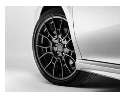
TRD 19-in. matte-black alloy wheels