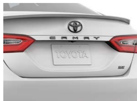
Blackout emblem overlays