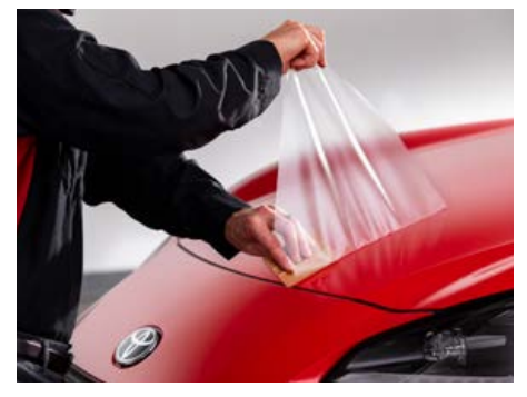
Paint protection kit<sup>24</sup>