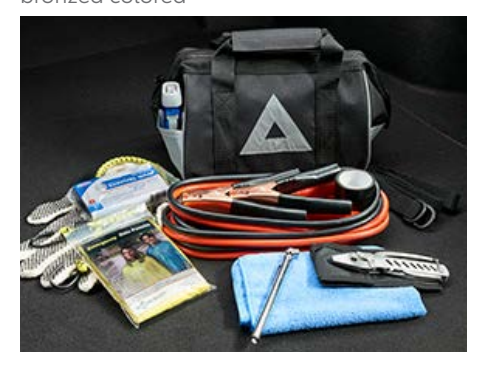
Emergency assistance kit