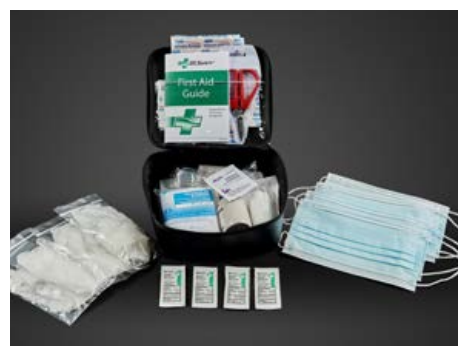
First aid kit with PPE