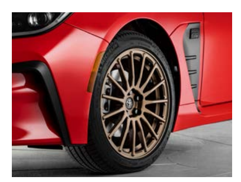
17-in. GR forged alloy wheels — bronzed colored

A wide range of Genuine Toyota Accessories is available to help make driving your GR86 even more fun. Now your GR86 can reflect your personal style. There's something for everyone. Some accessories may not be available in all regions of the country. For a complete list of accessories, go to toyota.com/gr86.