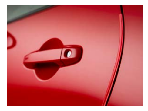
Door edge guards