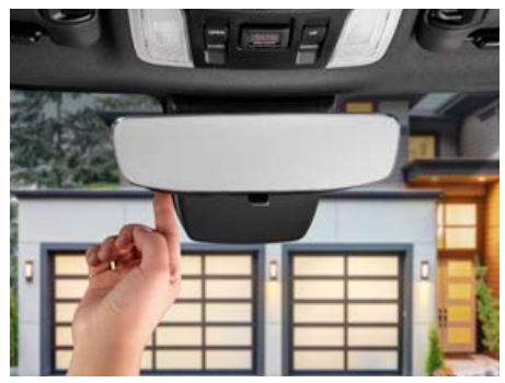
Frameless HomeLink®23 mirror