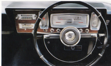
The New Galaxie 500 Steering Wheel hub is deep-padded and impact-absorbing for your added safety.

Through the doors of the Galaxie 500 lies a spacious world of tasteful luxury and careful design. Lavish foam-cushioning surrounds you. All upholsteries are of rich expanding-type vinyl, perforated and pleated for your comfort. Deep-pile wall-to-wall carpeting is soft underfoot. Your vision is wide and unhindered. You control the climate with Galaxie's silent ventilation system assisted by a 3-speed heater-demister. A push-button radio is provided. All instruments are easy to read, all controls easy to reach. The accelerator automatically adjusts to your foot. The brakes are self-adjusting, and work from a dual-braking system for extra safety. There's also safety in the new steering-wheel hub and the double-grip door-locks. Courtesy and reading lights are conveniently placed overhead . . . the glove box and the boot are also illuminated.