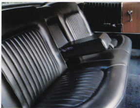
Rear seat passengers enjoy the comfort of contoured seating and ample leg and shoulder room.