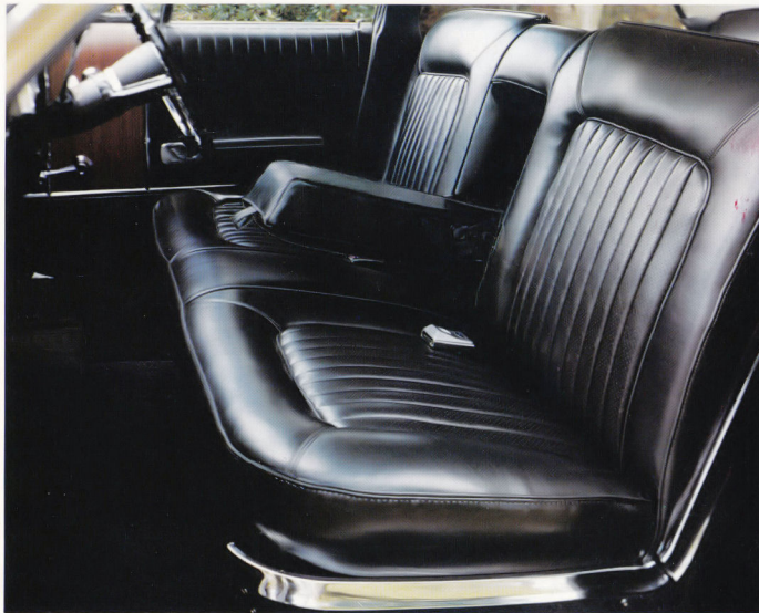
The Galaxie 500 Interior. The truly luxurious seating is specially designed for maximum comfort, featuring foldaway centre arm-rest and deep foam-cushioning. The upholstery is pleated and also perforated.