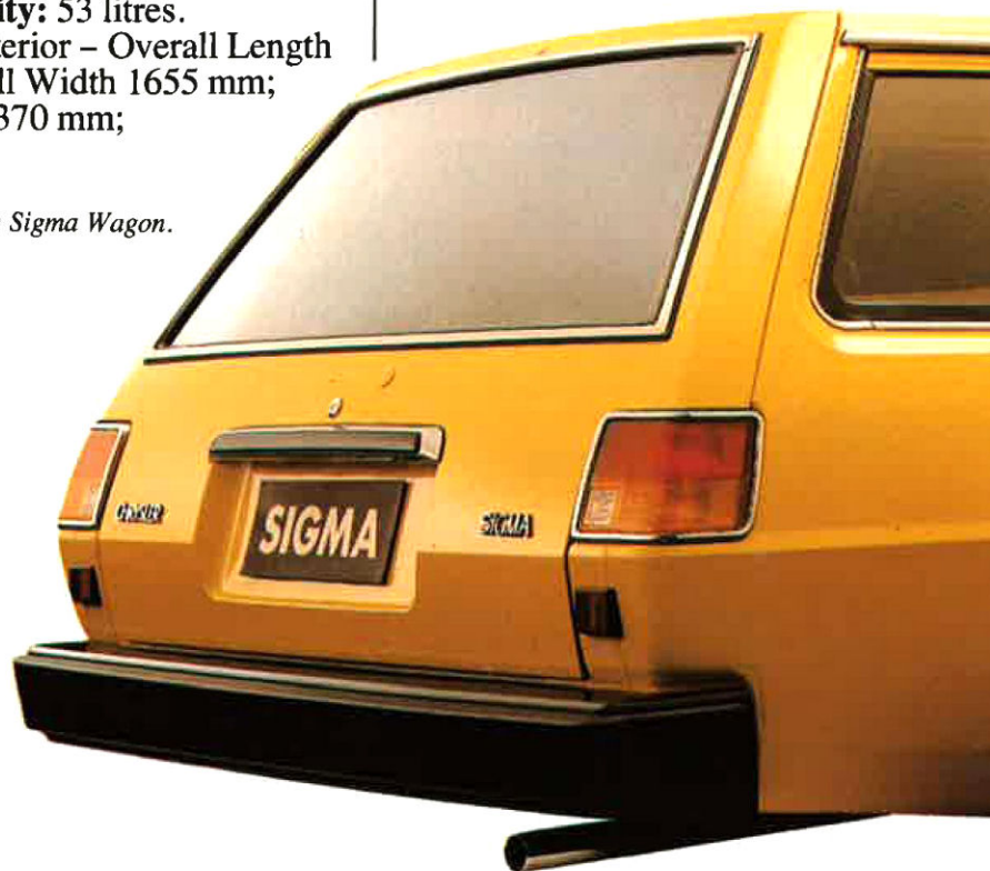
Tail of the Sigma Wagon.