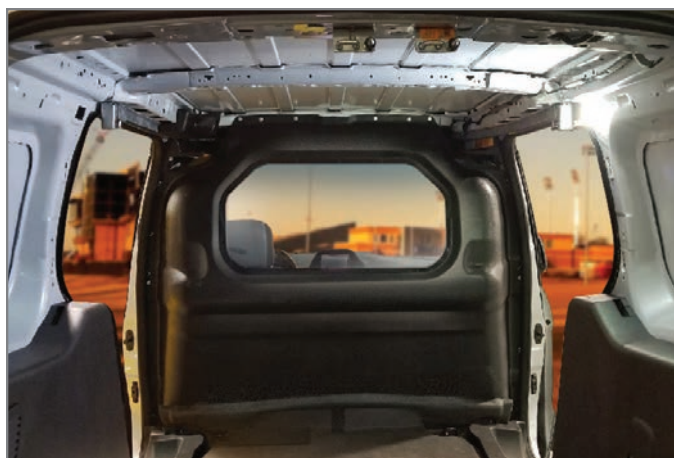
Shown with available window