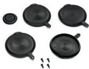
Lower Plug Kit