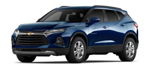
Blue Glow Metallic