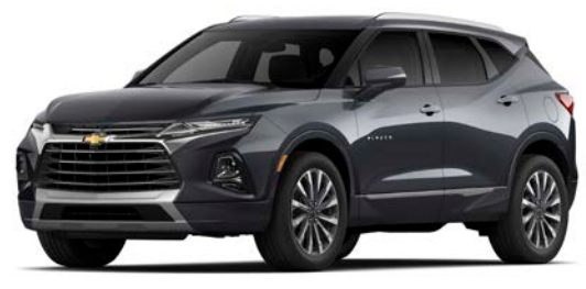
Iron Gray Metallic