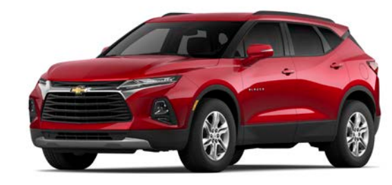
Cherry Red Tintcoat<sup>1</sup>