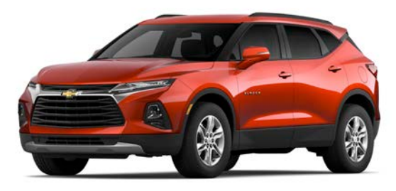
Cayenne Orange Metallic<sup>1</sup>