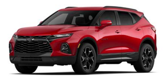
Cherry Red Tintcoat<sup>1</sup>