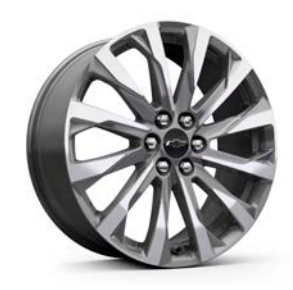
20" Machined-Face Aluminum Wheels with Medium Android-Painted Pockets Standard on Premier