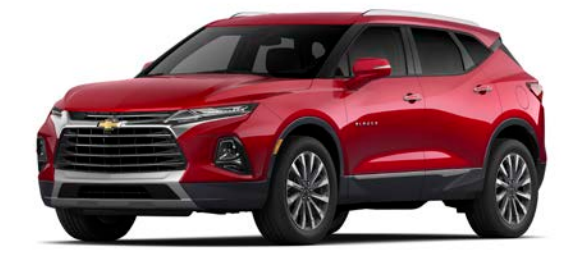
Cherry Red Tintcoat<sup>1</sup>