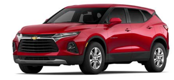
Cherry Red Tintcoat<sup>1</sup>