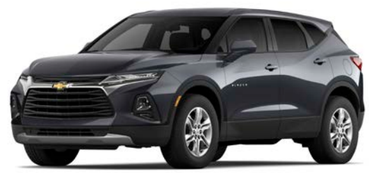
Iron Gray Metallic