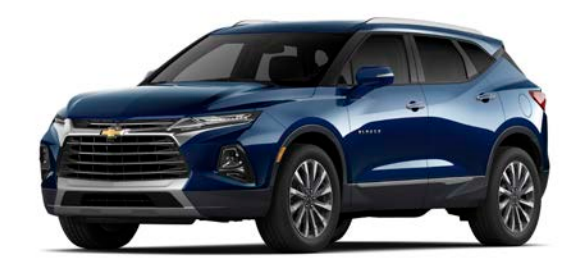
Blue Glow Metallic