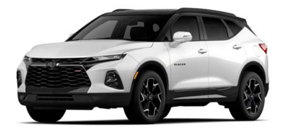
Black/Iridescent Pearl Tricoat<sup>1,2</sup>