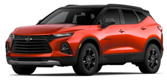
Black/Cayenne Orange Metallic<sup>1, 2</sup>