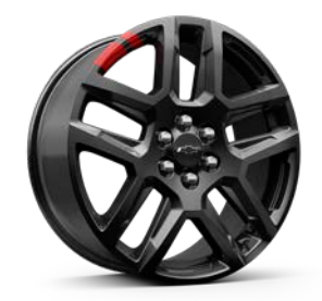
20" Gloss Black-Painted Aluminum Wheels with Red Accents Available on 2LT with Redline Edition

1 Chevrolet Infotainment System functionality varies by model. Full functionality requires compatible Bluetooth and smartphone, and USB connectivity for some devices. 2 Not compatible with all devices. 3 If you decide to continue service after your trial, your selected subscription plan will automatically renew thereafter. You will be charged at then-current rates. Fees and taxes apply. To cancel you must call SiriusXM at 1-866-635-2349. See SiriusXM Customer Agreement for complete terms at siriusxm.com. All fees and programming subject to change. 4 Not available with Summit White, Red Hot or Cayenne Orange Metallic exterior colors.