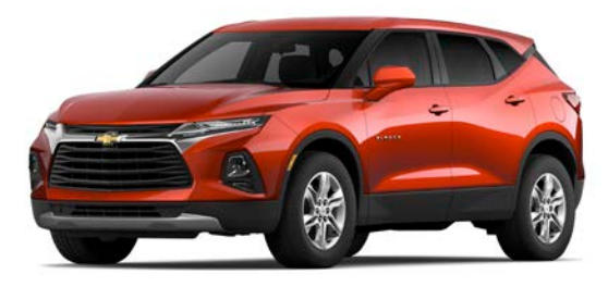
Cayenne Orange Metallic<sup>1</sup>