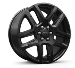
20" Gloss Black-Painted Aluminum Wheels Available on 2LT