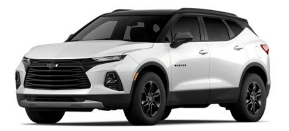
Black/Iridescent Pearl Tricoat<sup>1,2</sup>