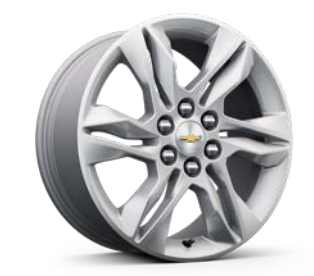
18" Bright Silver-Painted Aluminum Wheels Standard on 2LT