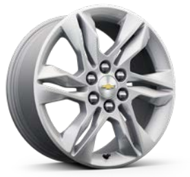
18" Bright Silver-Painted Aluminum Wheels Standard on 3LT