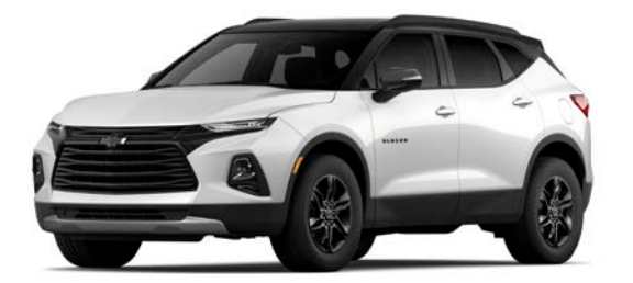
Black/Iridescent Pearl Tricoat<sup>1,2</sup>