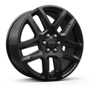
20" Gloss Black-Painted Aluminum Wheels Available on Premier

1 Chevrolet Infotainment System functionality varies by model. Full functionality requires compatible Bluetooth and smartphone, and USB connectivity for some devices. 2 Map coverage available in the United States, Puerto Rico and Canada. 3 Safety or driver assistance features are no substitute for the driver's responsibility to operate the vehicle in a safe manner. Read the vehicle Owner's Manual for important feature limitations and information. 4 If you decide to continue service after your trial, your selected subscription plan will automatically renew thereafter. You will be charged at then-current rates. Fees and taxes apply. To cancel you must call SiriusXM at 1-866-635-2349. See SiriusXM Customer Agreement for complete terms at siriusxm.com. All fees and programming subject to change. Certain features require a SiriusXM subscription and the Chevrolet Connected Access plan. See siriusxm.com and onstar.com for details and limitations.