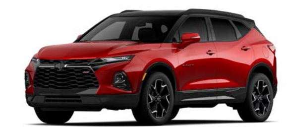
Black/Cherry Red Tintcoat<sup>1,2</sup>