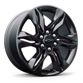
18" Gloss Black-Painted Aluminum Wheels Available on 2LT with Midnight/Sport Edition