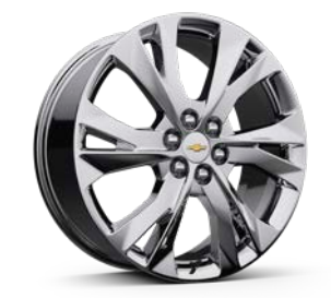
21" Pearl Nickel-Painted Aluminum Wheels Available on Premier