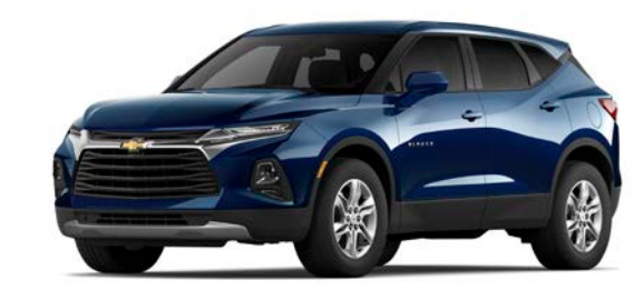
Blue Glow Metallic