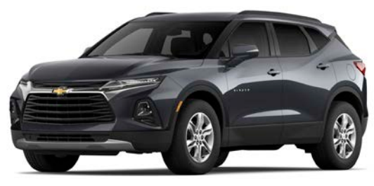
Iron Gray Metallic