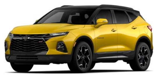
Black/Nitro Yellow Metallic<sup>1,2</sup>