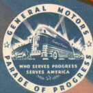
Chairman GENERAL MOTORS CORPORATION

There is cause for confidence in our ability to meet the responsibilities that face us. Through a broad understanding of the means at our command and through the cooperation of all, we can not only raise impregnable ramparts of defense, but we can secure and ultimately advance our way of life for tomorrow. Thus America will gain a strong right arm and a powerful constitution to back it up.