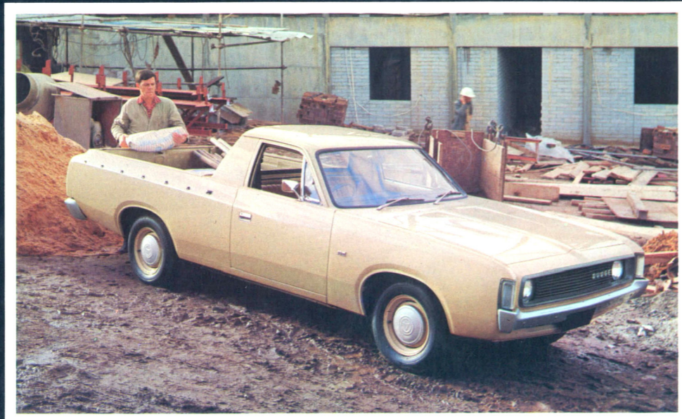
The new Dodge (below) gives you rugged reliability and value at a price that's way down.