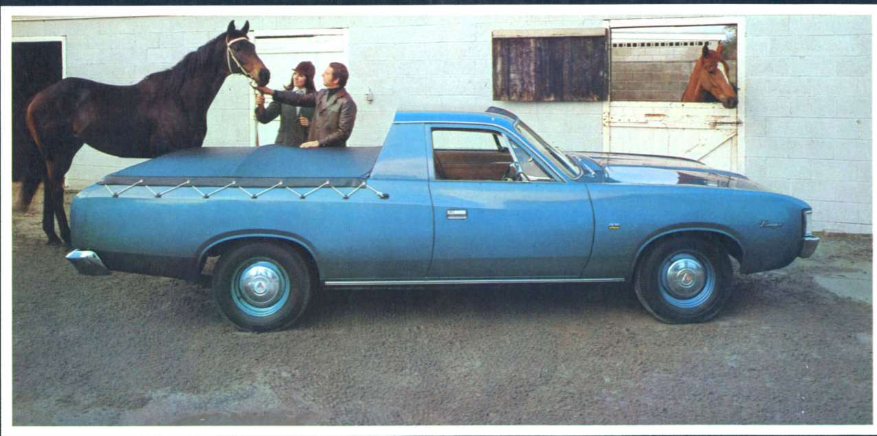
New Valiant Ranger (above) even gives you the luxury of a bigger load space.