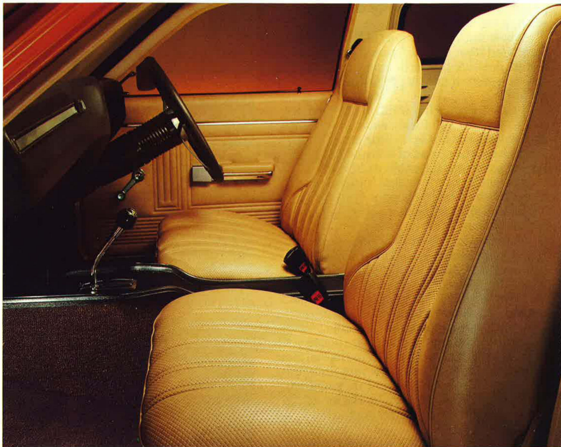
Deep vinyl bucket seats shown with optional automatic with centre console.

The Chrysler Valiant Sports Van sets the workhorse loose on this big country, to carry your fun right to where you want to have it.