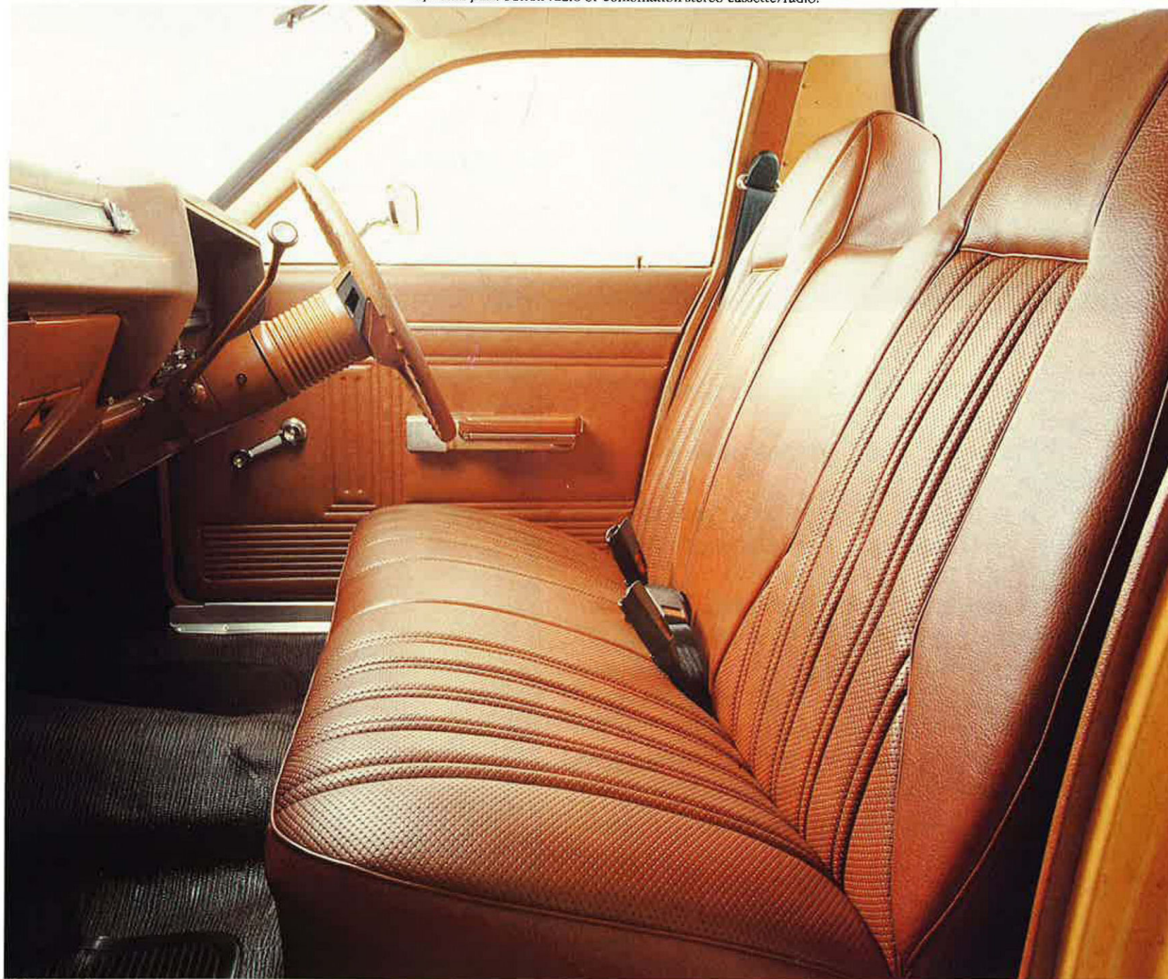
Multi-use stalk control.