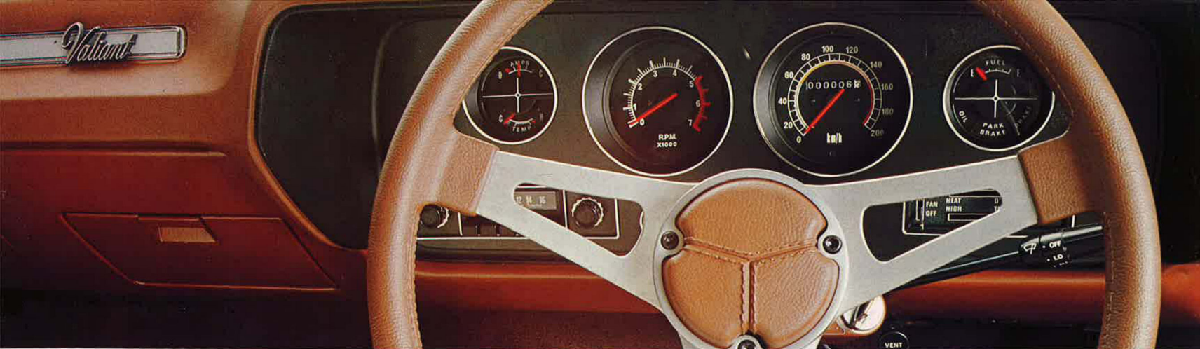
Sports Pack dash with optional radio.

You know what they are doing with vans these days.