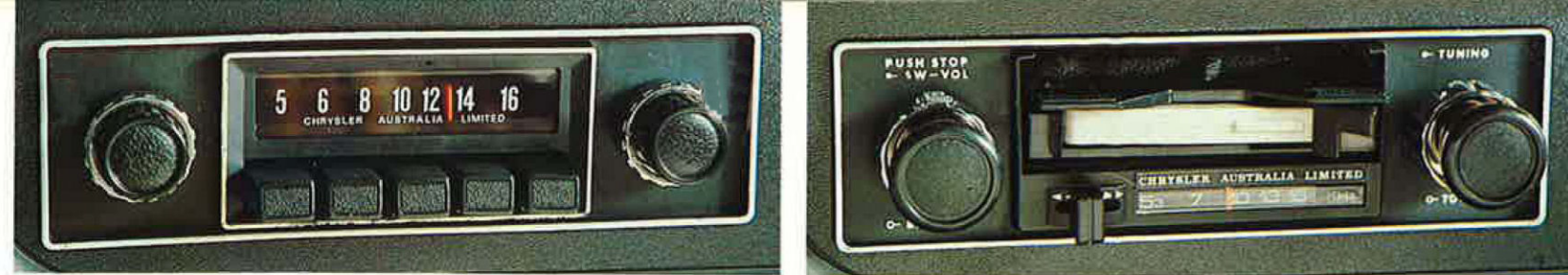
Optional push-button radio or combination stereo cassette/radio.

Chrysler Valiant Van: it works for its living, depend on it to earn yours.