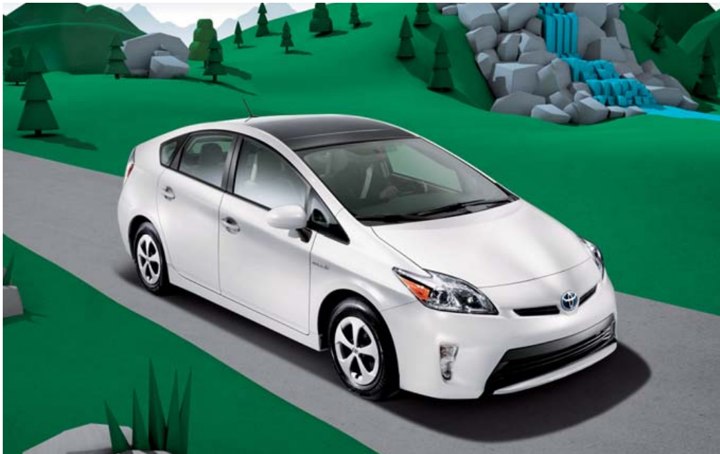
Prius Four shown in Blizzard Pearl with available Deluxe Solar Roof Package!