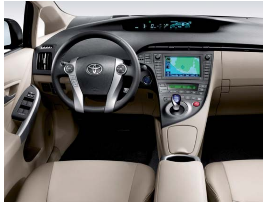
Prius Four interior shown in Bisque SofTex® trim with available Deluxe Solar Roof Package!

The 2013 Toyota Prius has demonstrated that there can be harmony between man, nature and machine. Prius has also shown that there can be consensus among many different types of drivers. Those who demand fuel efficiency, and those who like to take the fast lane. Those intrigued by advanced technology, and those who want proven reliability. Those interested in reducing their carbon footprint, and those hesitant to sacrifice practicality in order to do it. With all that Prius has to offer, it may be the one vehicle we can all agree on. 2013 Toyota Prius.