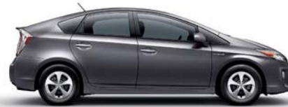
WINTER GRAY METALLIC