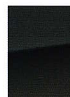
Black Pearl 676

The color of the sky before a storm, with its complexity and special energy, as well as the musical style, giving the name to this shade.