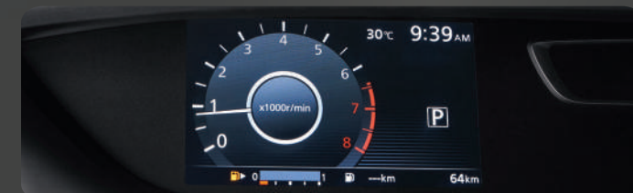
Advance Color TFT Multi Information Display (MID) menyediakan berbagai informasi kendaraan termasuk digital Tachometer.