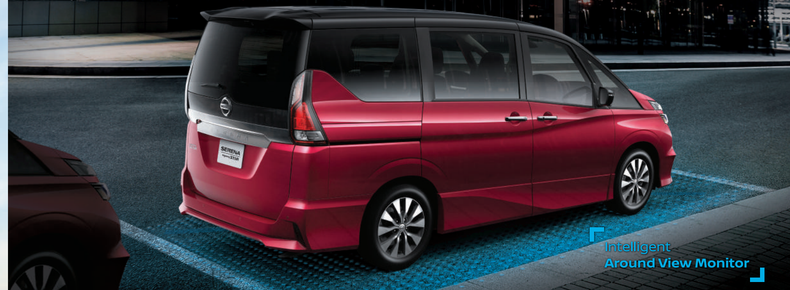
Intelligent Around View Monitor