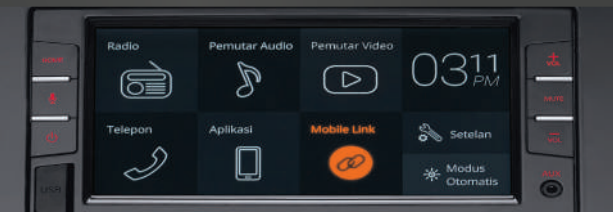
Multi Media Display (MMD) with Smartphone Connectivity Head Unit