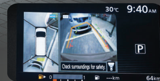
MID with I-AVM and MOD

Dibekali kamera di empat sisinya, memudahkan Anda untuk parkir dan melihat keadaan sekeliling mobil secara menyeluruh. Dilengkapi juga dengan Moving Object Detector (MOD) yang memberi tahu saat ada sesuatu yang bergerak di belakang mobil.