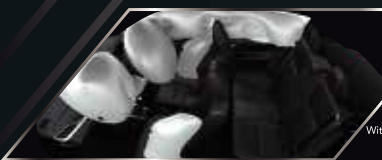
7 SRS Airbags Full protection for the whole car. (All Type)