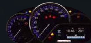
Progressive Optitron Combination Meter with TFT MID

Remarkable design with multi information display.