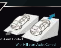
Hill-Start Assist Prevents vehicle from rolling back on steep hills. (All Type)