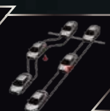
ABS + EBD + BA Ensure maximum braking safety. (All Type)