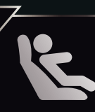
ISOFIX with Tether Anchor International standard to securely keep child seat in place. (All Type)