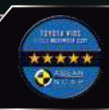
ASEAN NCAP Safety Rating Journey with more confidence as Vios has received five-star ASEAN NCAP rating in crash & safety test. (All Type)