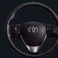
Leather Steering Wheel with Audio & TFT Switch

Effortlessly take control of entertainment unit with the new leathered smart steering wheel.