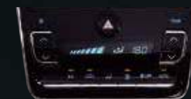
Auto AC with Digital Display

Precision-controlled air flow that lets you enjoy your cruise in perfect comfort.