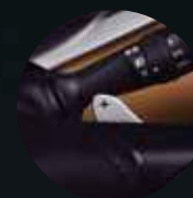
Convenient Paddle Shift

Have fun accelerating in full confidence.