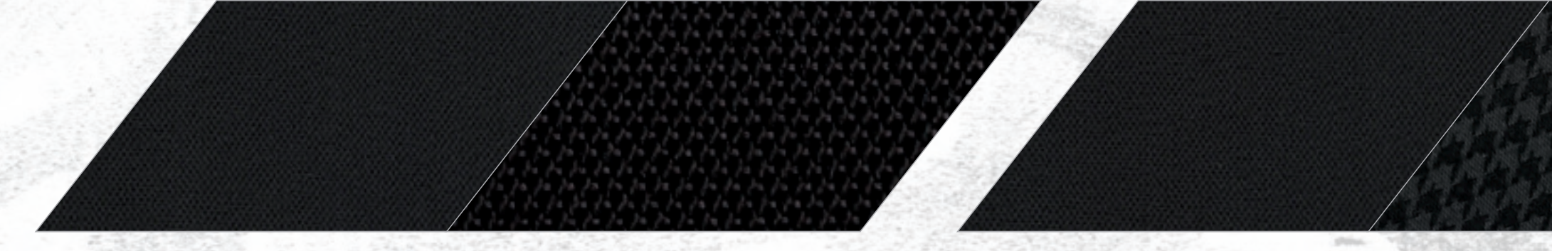
SEDOSO / TORQUE SPORT CLOTH WITH TUNGSTEN ACCENT STITCHING – BLACK. STANDARD ON SXT RWD AND SXT AWD