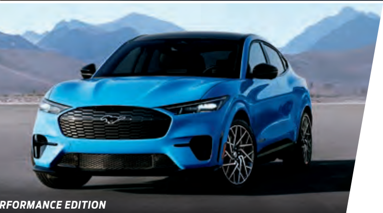
GT PERFORMANCE EDITION