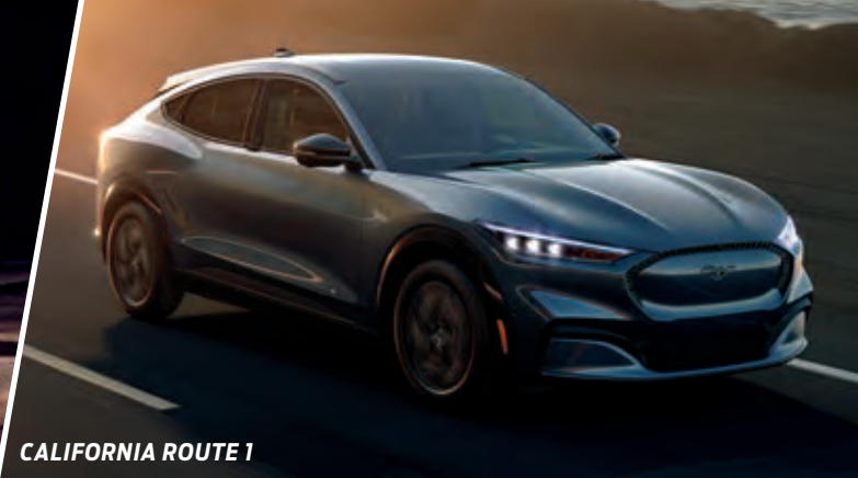
CALIFORNIA ROUTE 1