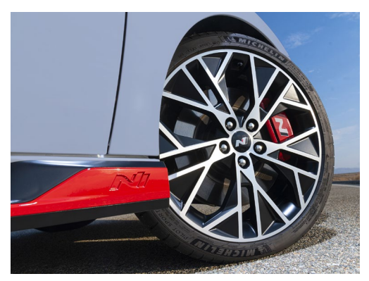
N 19" alloy wheels with Michelin Pilot Sport 4S summer tires N logo-engraved side moulding with red accents*