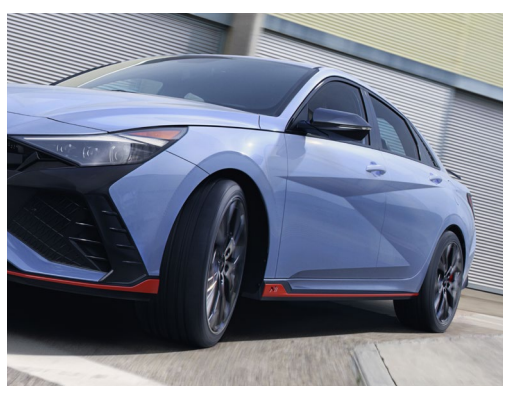
Side body with sculpted Parametric surfaces