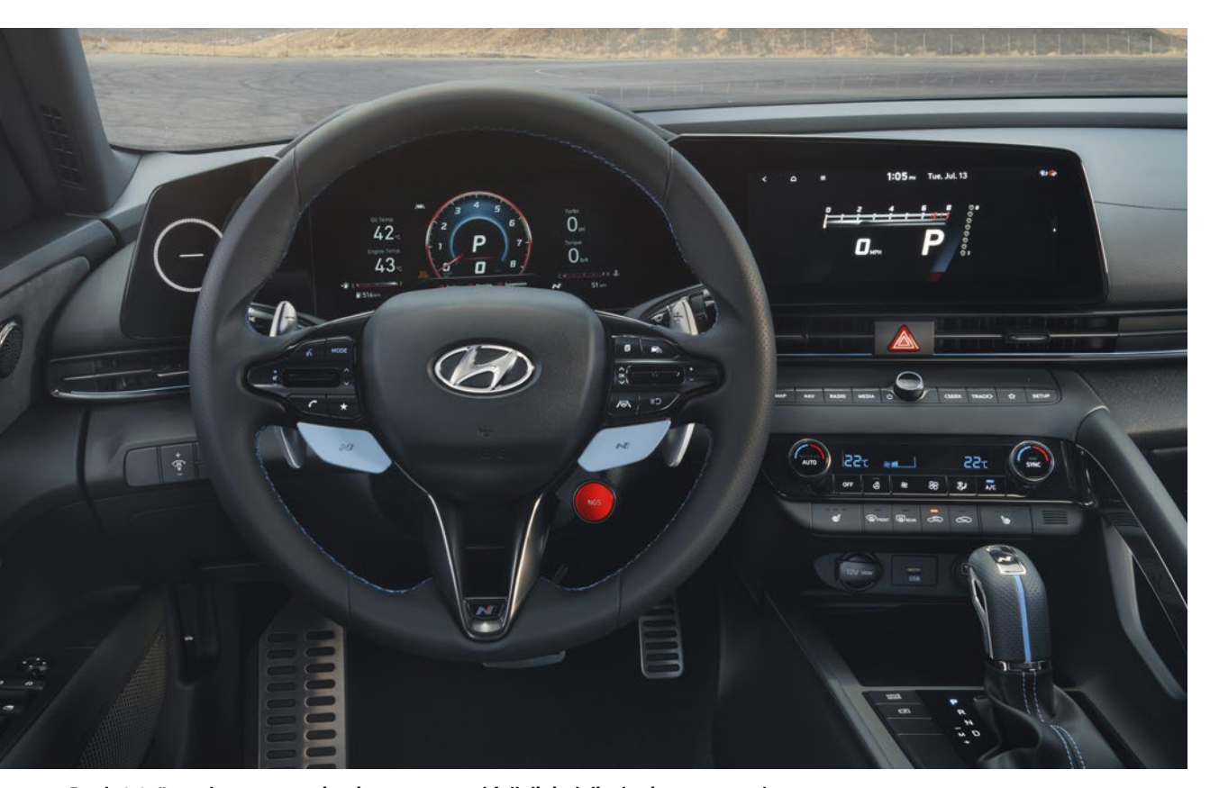
Dual 10.25" touch-screen navigation system and full digital display instrument cluster

And stay connected to your vehicle and the world with Bluelink® and a three-month trial of SiriusXM™ satellite radio.