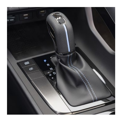
N gear shift knob