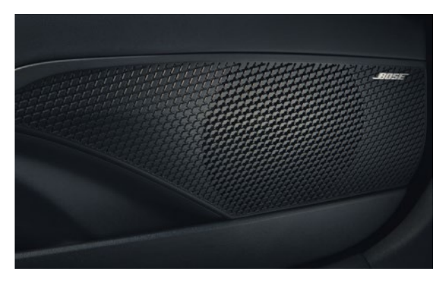
Bose® premium audio system with eight speakers