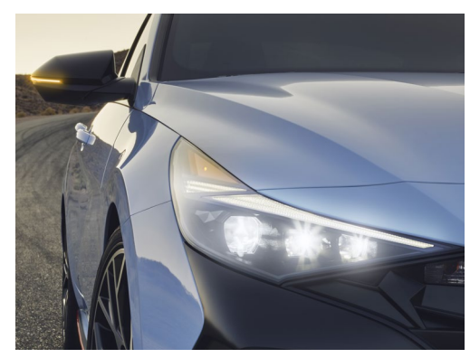
LED projection-type headlights LED daytime running lights LED mirror-mounted turn signals