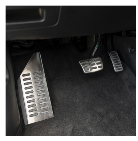
Alloy sport pedals