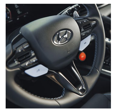
N leather-wrapped steering wheel with N mode buttons