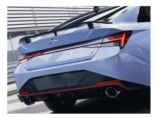
Wing-type rear spoiler N rear bumper and diffuser Variable exhaust valve system with dual outlets