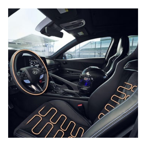
Heated front seats and steering wheel