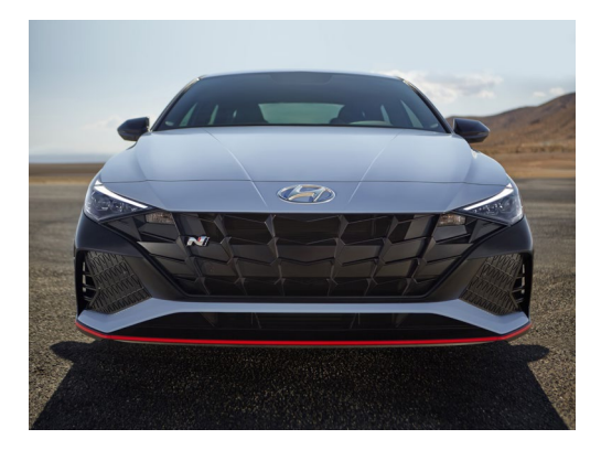
N front fascia with unique red front lip*

The ELANTRA N doesn't just turn corners, it turns heads. From its race car-inspired N front fascia with stunning red lip* to its parametrically sculpted side body with N logo engraved side moulding with red accents* to its wing-type rear spoiler and N rear bumper and diffuser, everything about the exterior of the ELANTRA N exudes performance.