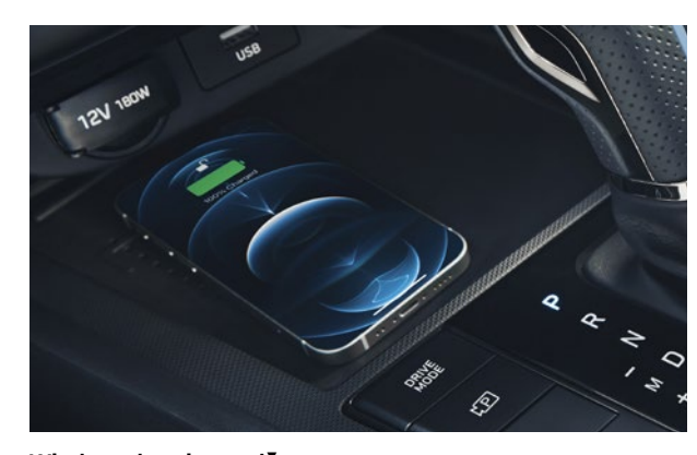
Wireless charging pad ▼