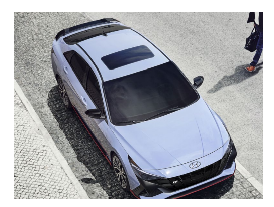
Power tilt-and-slide sunroof