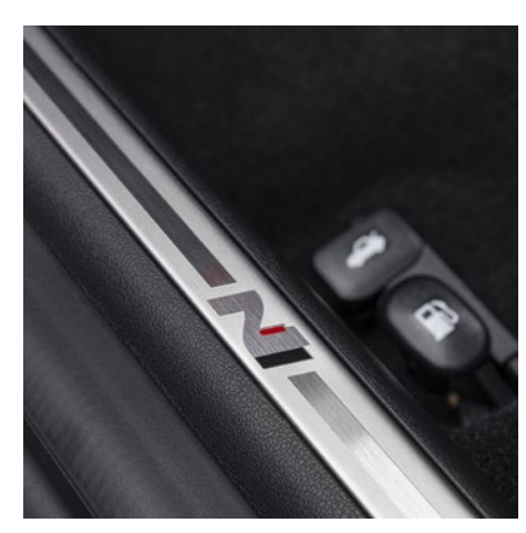
Aluminum N door scuff