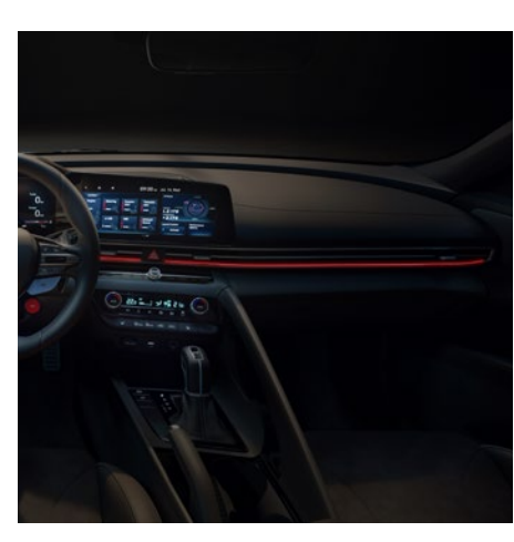
Interior ambient light (64 colours)