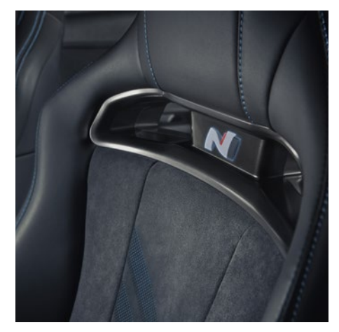
N lightweight sport bucket seats, leatherette with microsuede inserts, illuminated N logo

The ELANTRA N surrounds its driver in complete comfort, style and safety, including heated front seats and steering wheel, distinctive aluminum N door scuffs and high-performance sport bucket seats designed for improved passenger stability during high-speed driving and cornering.