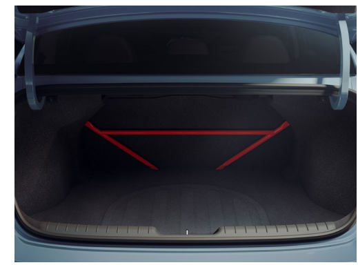
Rear strut bar offers an enhanced body rigidity increase of 29%, compared to the standard ELANTRA model