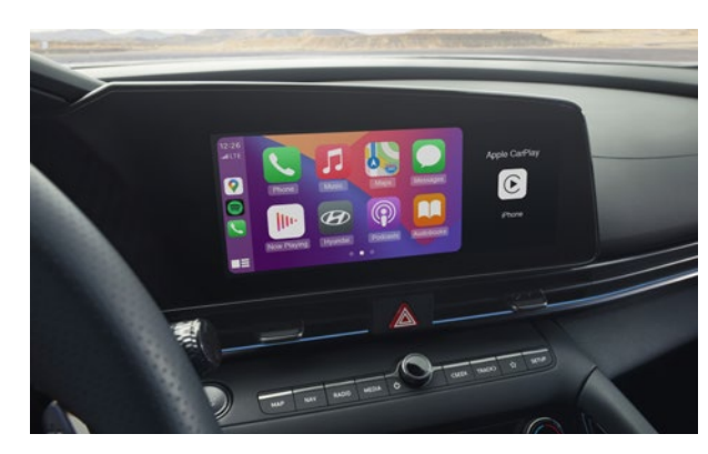
Apple CarPlay<sup>™∆</sup> and Android Auto<sup>™⋄</sup> Bluelink<sup>®Ω</sup> and SiriusXM<sup>™‡</sup>