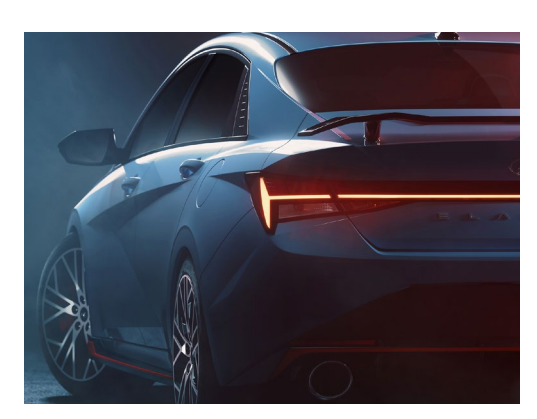
Full LED tail lights