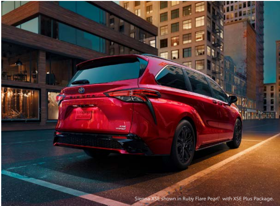
Sienna XSE shown in Ruby Flare Pearl 1 with XSE Plus Package.