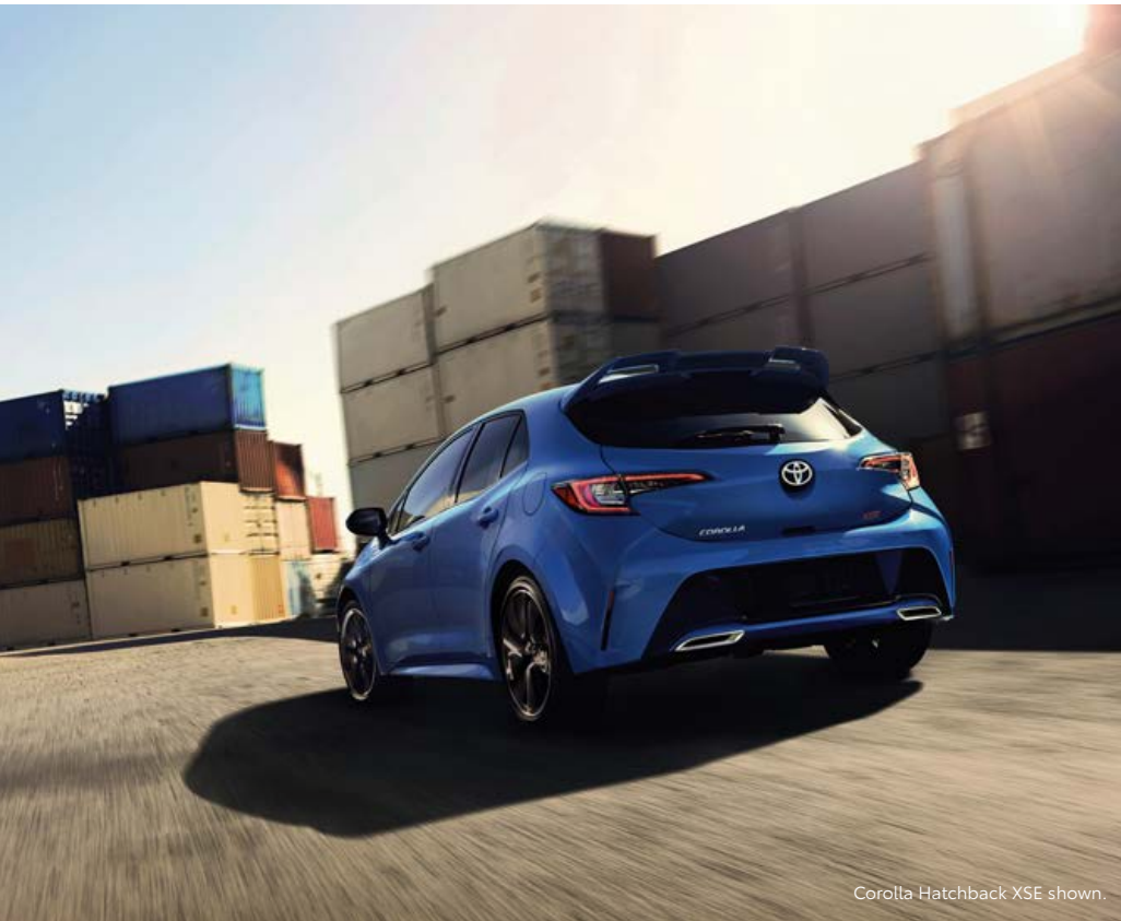
Corolla Hatchback XSE shown.