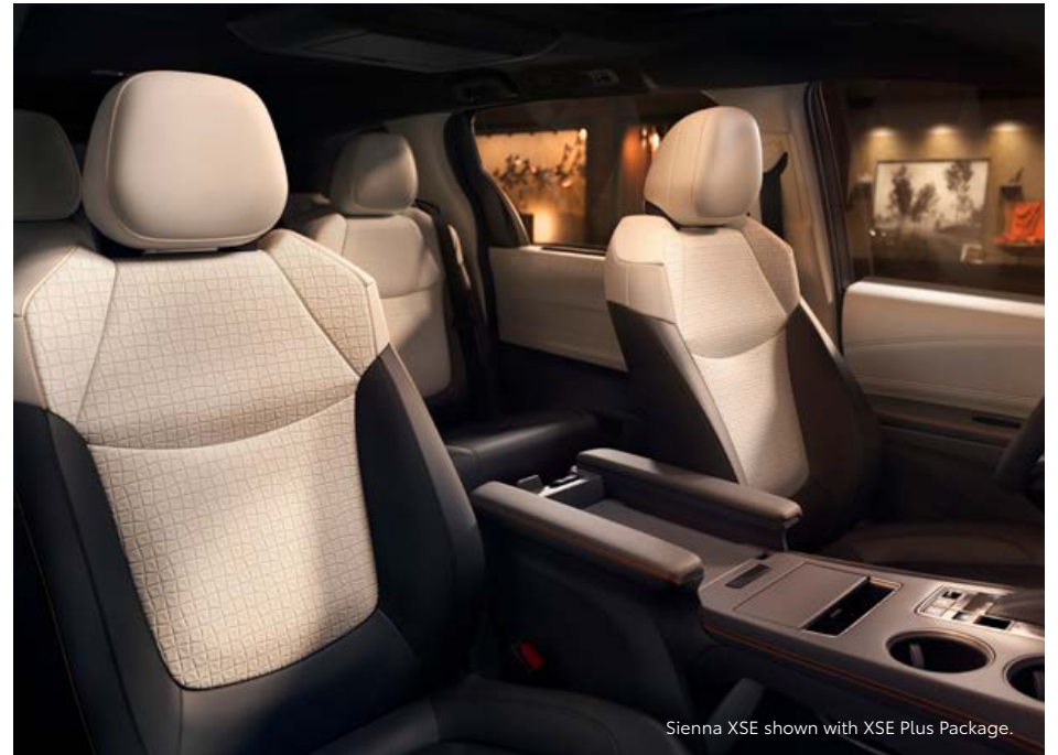
Sienna XSE shown with XSE Plus Package.