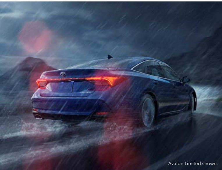
Avalon Limited shown.