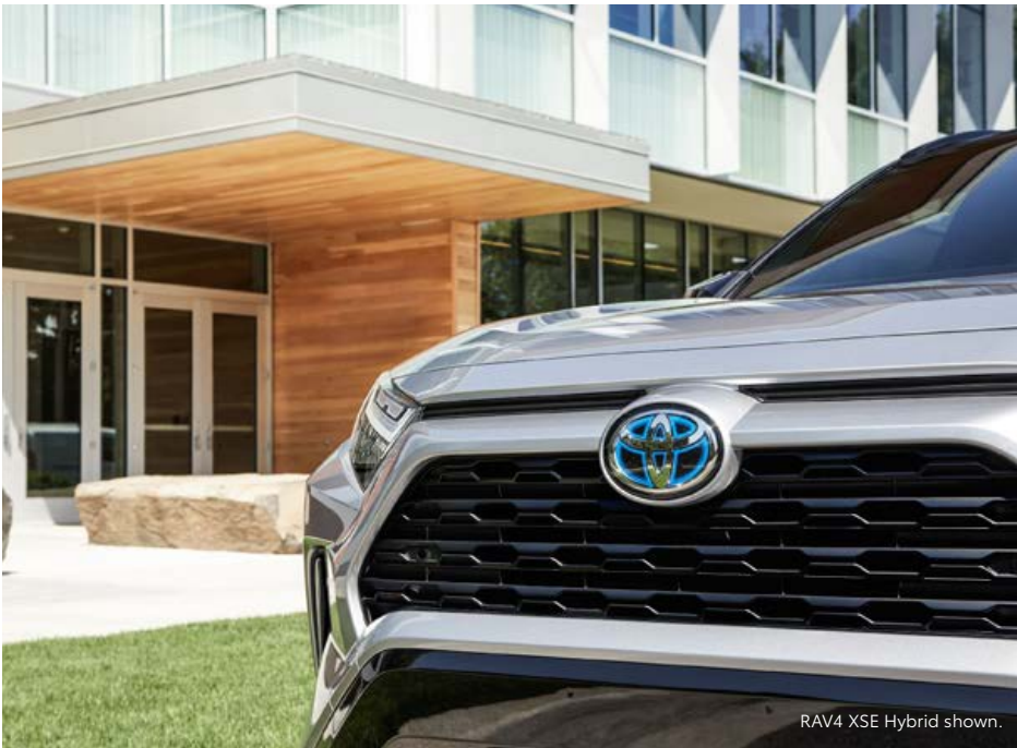
RAV4 XSE Hybrid shown.