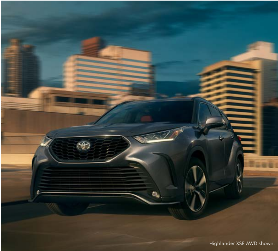
Highlander XSE AWD shown.