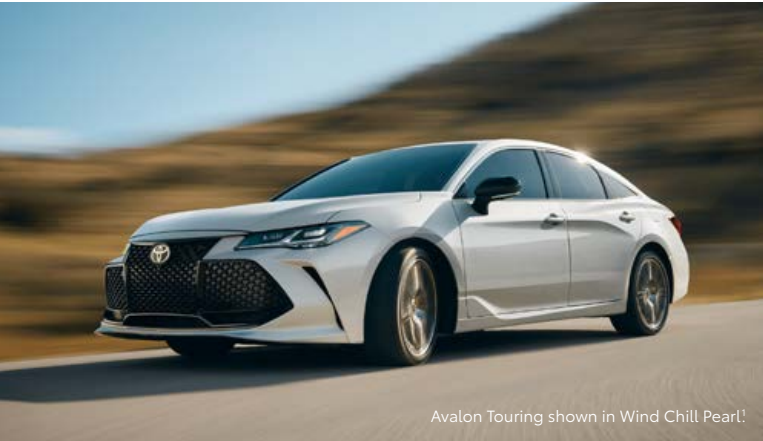
Avalon Touring shown in Wind Chill Pearl. 1