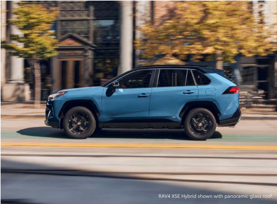
RAV4 XSE Hybrid shown with panoramic glass roof.