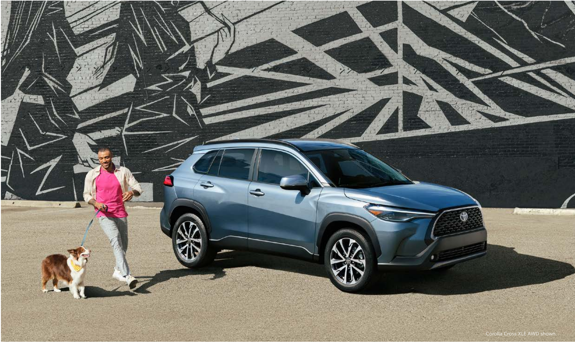
Corolla Cross XLE AWD shown.