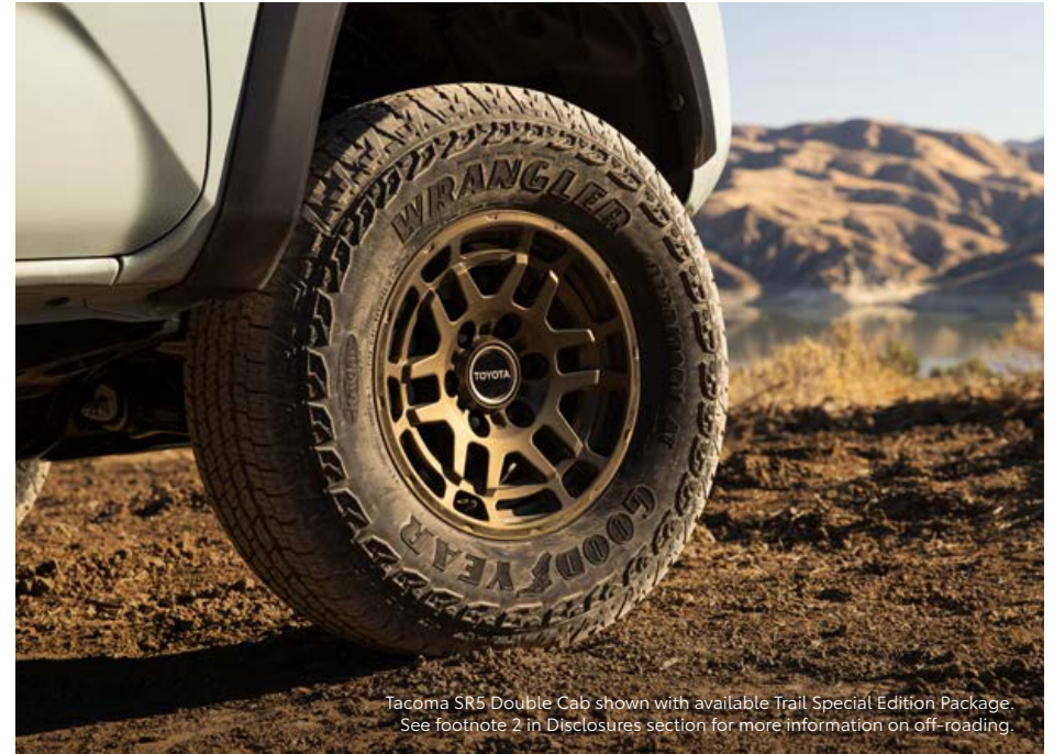
Tacoma SR5 Double Cab shown with available Trail Special Edition Package. See footnote 2 in Disclosures section for more information on off-roading.

With available off-road features like Crawl Control 5 , an electronically locking rear differential and Bilstein ®6 shocks, Tacoma is ready to play harder than ever before.