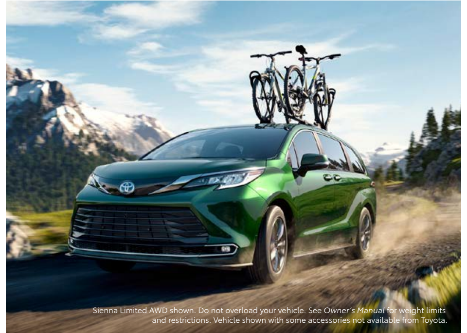
Sienna Limited AWD shown. Do not overload your vehicle. See Owner's Manual for weight limits and restrictions. Vehicle shown with some accessories not available from Toyota.