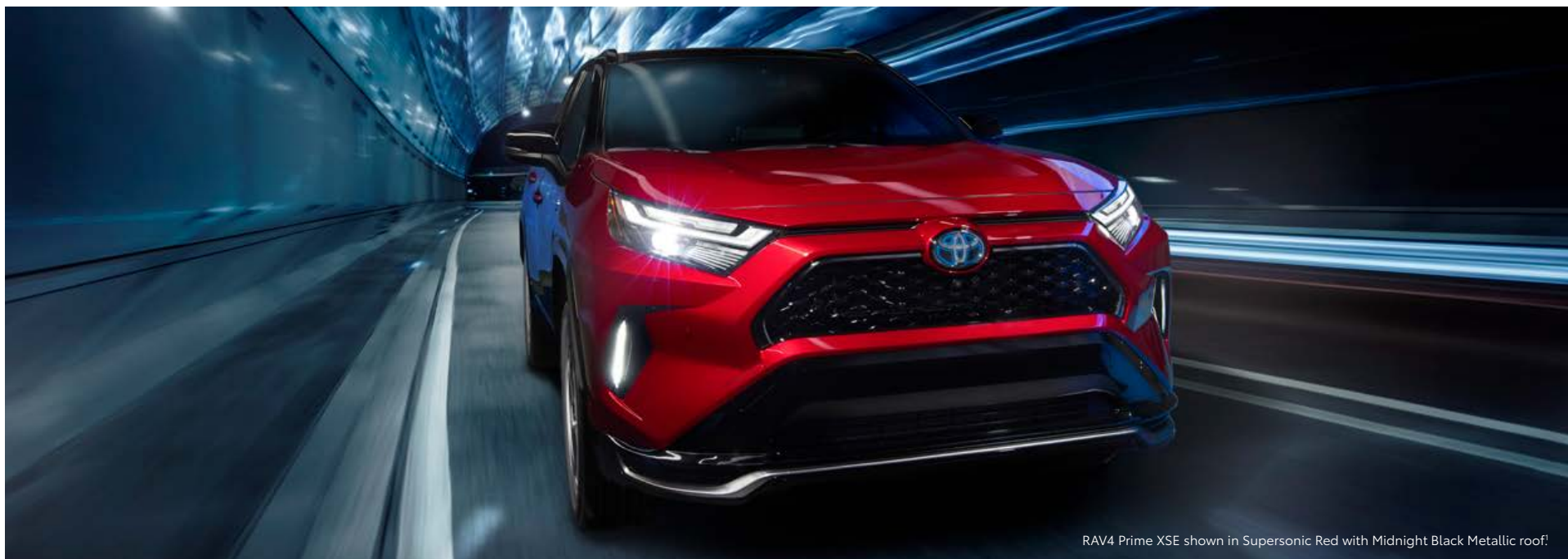
RAV4 Prime XSE shown in Supersonic Red with Midnight Black Metallic roof.