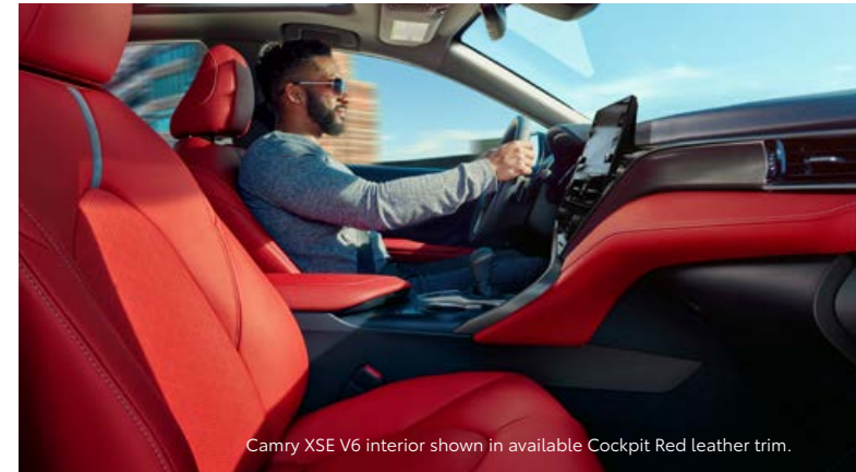
Camry XSE V6 interior shown in available Cockpit Red leather trim.