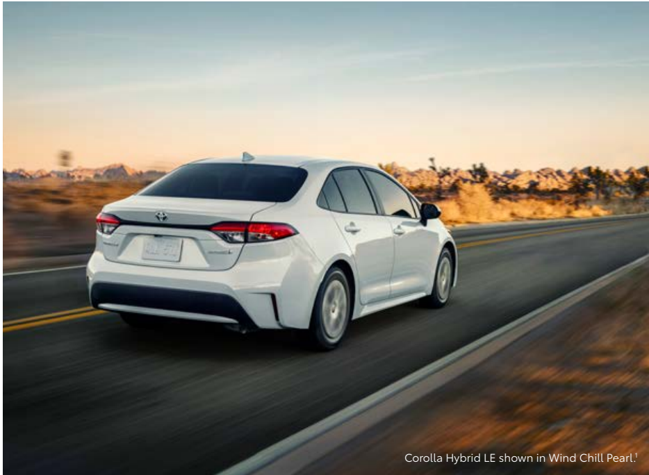
Corolla Hybrid LE shown in Wind Chill Pearl. 1