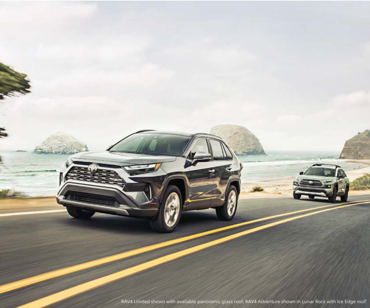
RAV4 Limited shown with available panoramic glass roof; RAV4 Adventure shown in Lunar Rock with Ice Edge roof.