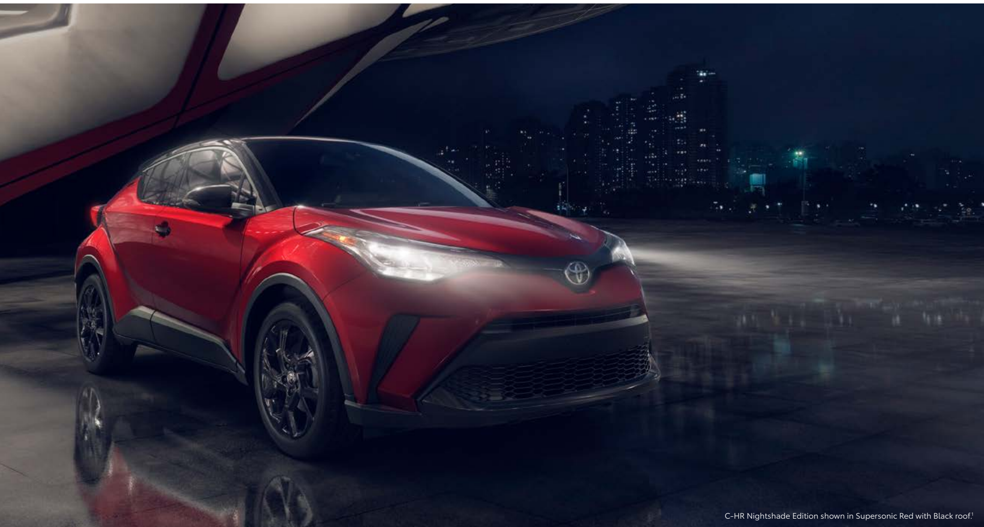
C-HR Nightshade Edition shown in Supersonic Red with Black roof. 1