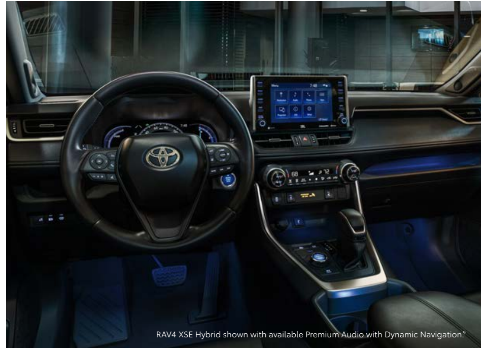
RAV4 XSE Hybrid shown with available Premium Audio with Dynamic Navigation. 9