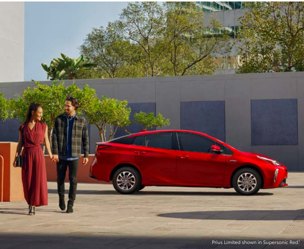
Prius Limited shown in Supersonic Red. 1