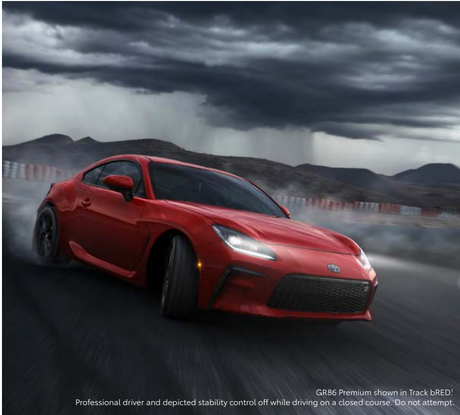
GR86 Premium shown in Track bRED! Professional driver and depicted stability control off while driving on a closed course. Do not attempt.