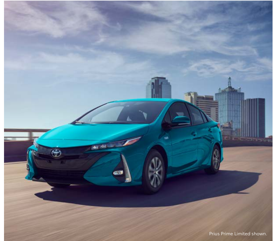
Prius Prime Limited shown.