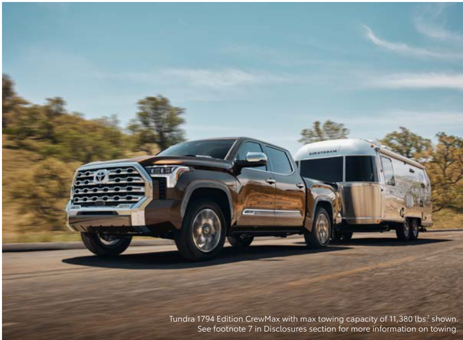
Tundra 1794 Edition CrewMax with max towing capacity of 11,380 lbs. 7 shown. See footnote 7 in Disclosures section for more information on towing.