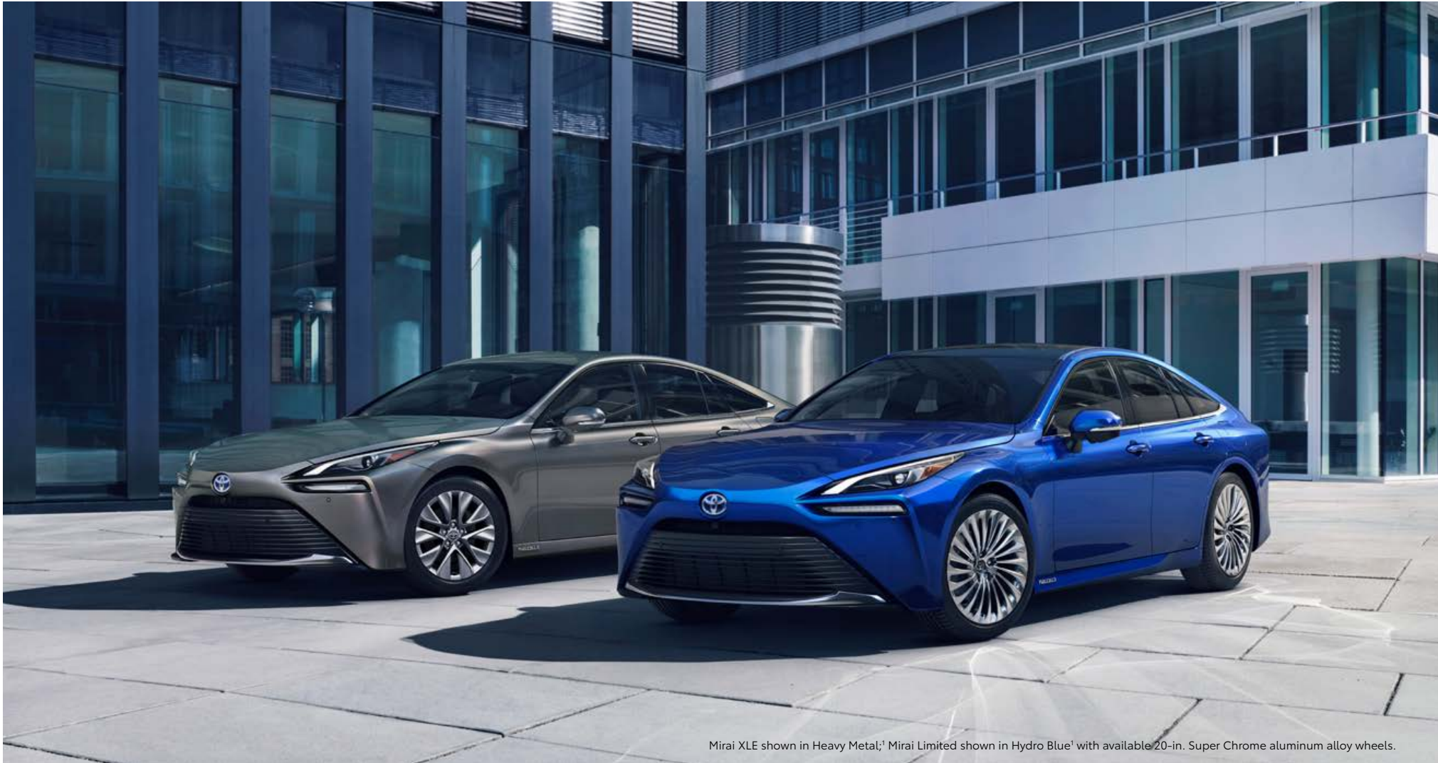
Mirai XLE shown in Heavy Metal; 1 Mirai Limited shown in Hydro Blue 1 with available 20-in. Super Chrome aluminum alloy wheels.

An innovative blend of power and efficiency, the hydrogen Fuel Cell Electric Mirai delivers an exciting, zero emission drive.