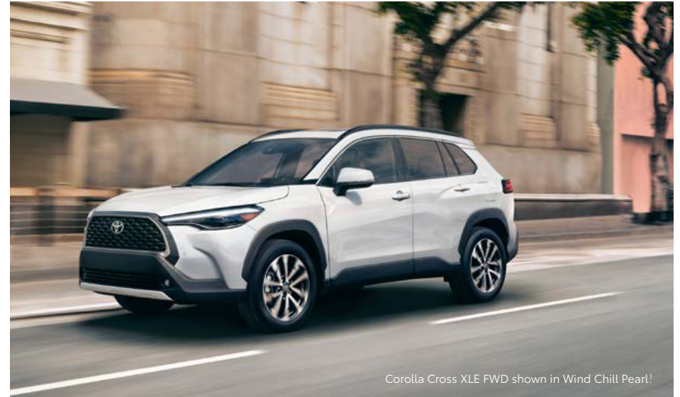
Corolla Cross XLE FWD shown in Wind Chill Pearl!

When the only constant thing in life is change, Corolla Cross is ready to help you take on what's next. From living on your own to moving forward with your career: Corolla Cross has all of the things you look for to get the most out of every day.