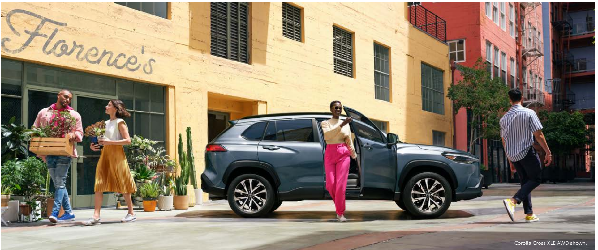
Corolla Cross XLE AWD shown.