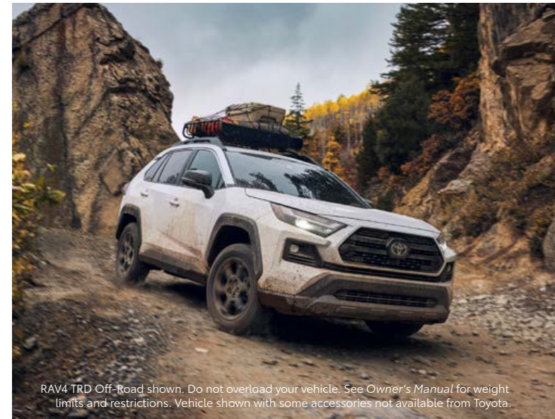
RAV4 TRD Off-Road shown. Do not overload your vehicle. See Owner's Manual for weight limits and restrictions. Vehicle shown with some accessories not available from Toyota.