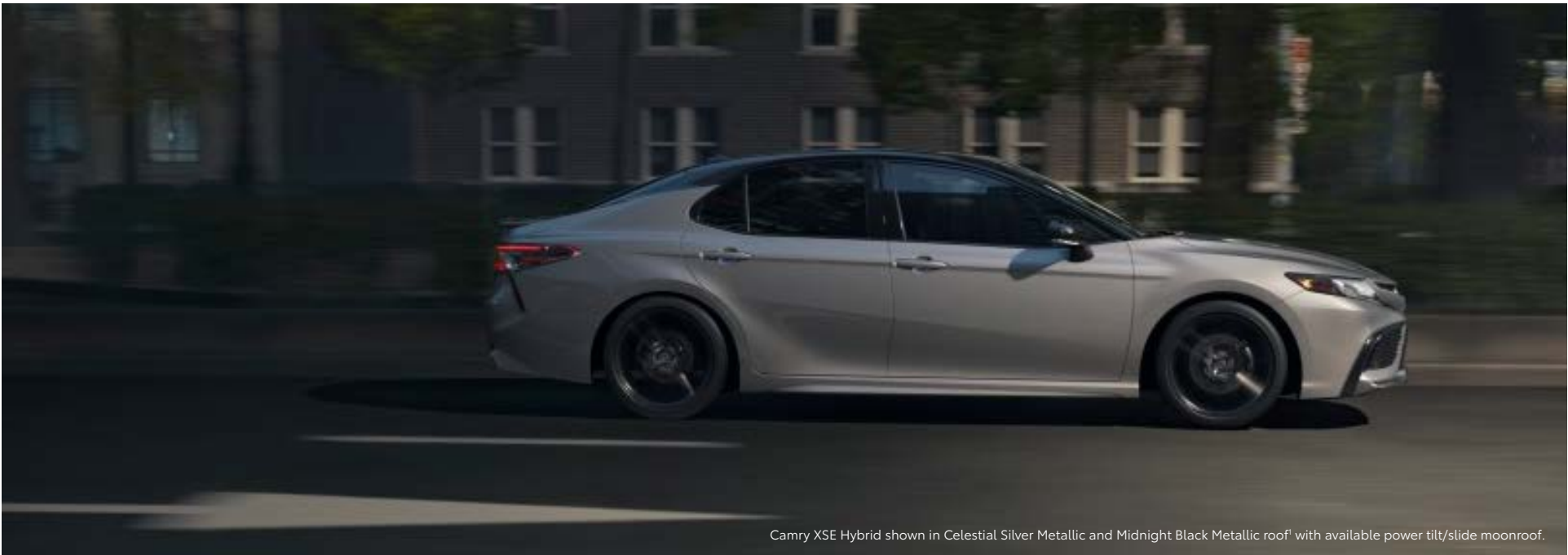
Camry XSE Hybrid shown in Celestial Silver Metallic and Midnight Black Metallic roof with available power tilt/slide moonroof.