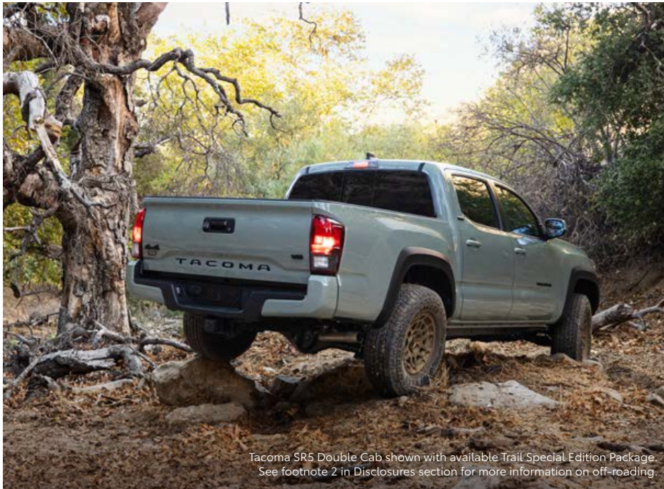
Tacoma SR5 Double Cab shown with available Trail Special Edition Package. See footnote 2 in Disclosures section for more information on off-roading.