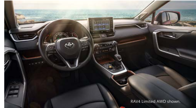
RAV4 Limited AWD shown.