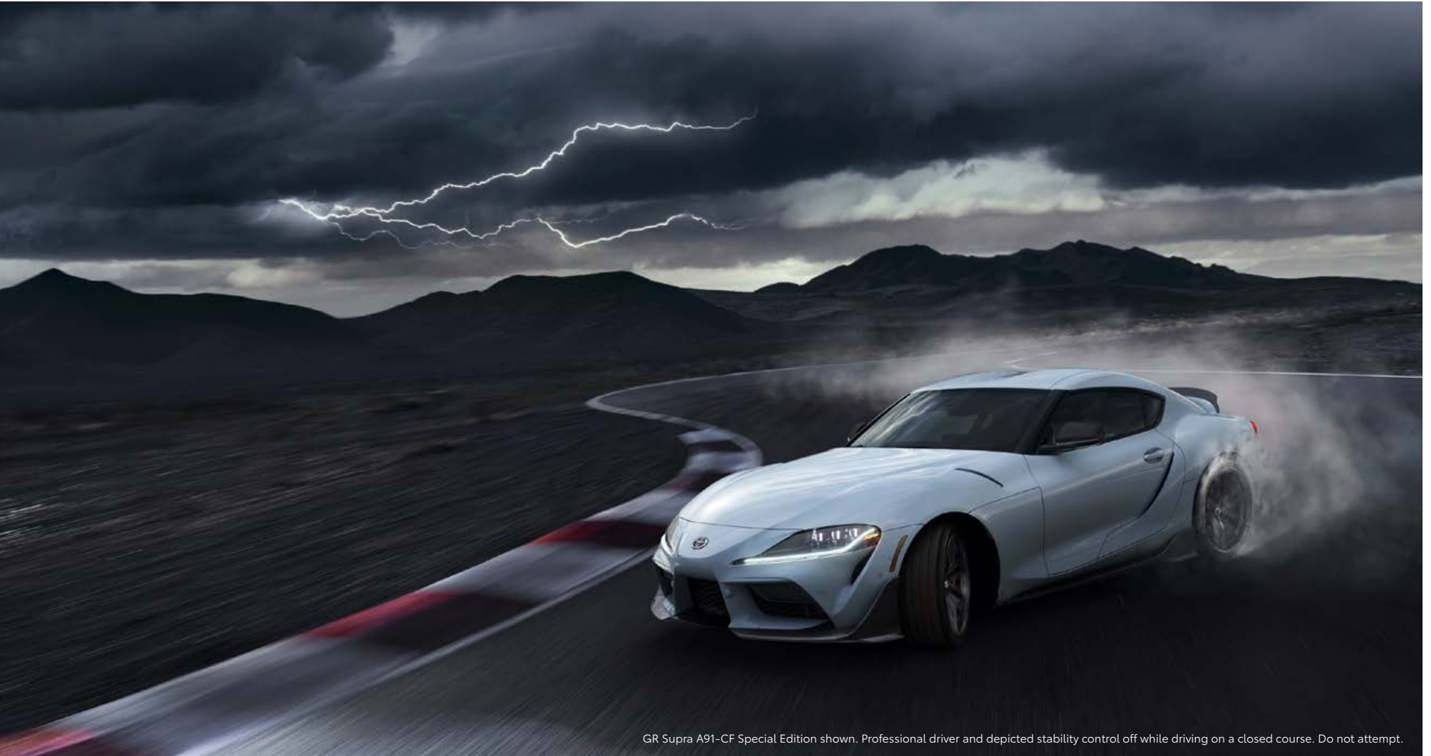
GR Supra A91-CF Special Edition shown. Professional driver and depicted stability control off while driving on a closed course. Do not attempt.