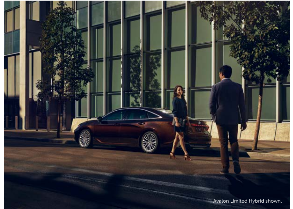
Avalon Limited Hybrid shown.

Underneath Avalon Hybrid's striking design are an impressive hybrid drivetrain and a wealth of technology ready to give you the most out of every drive.