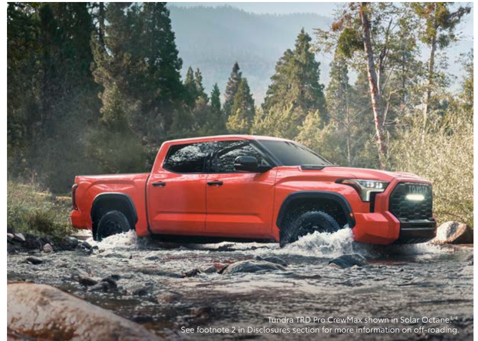
Tundra TRD Pro CrewMax shown in Solar Octane. 4 See footnote 2 in Disclosures section for more information on off-roading.