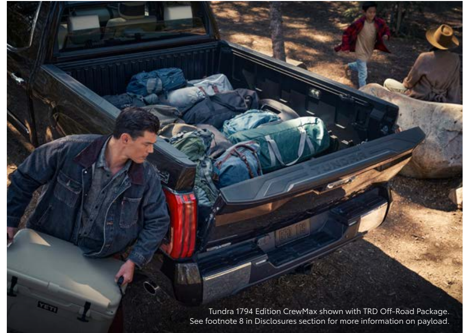
Tundra 1794 Edition CrewMax shown with TRD Off-Road Package. See footnote 8 in Disclosures section for more information on payload.

Feel Tundra's power with an impressive max towing capacity of up to 12,000 lbs. 7 Whether you're towing a trailer or a boat, Tundra lets you haul with confidence.