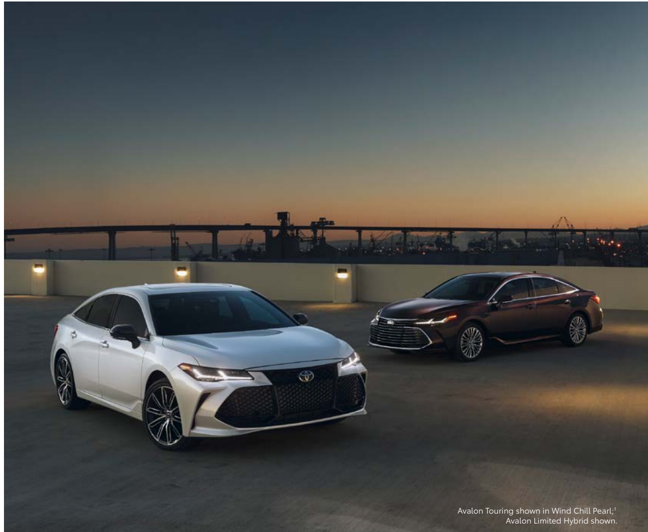
Avalon Touring shown in Wind Chill Pearl; 1 Avalon Limited Hybrid shown.