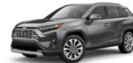
CROSSOVERS & SUVs