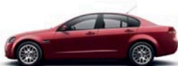
Red Passion Metallic*

Bluetooth® is a registered trademark and logo of Bluetooth SIG, Inc.