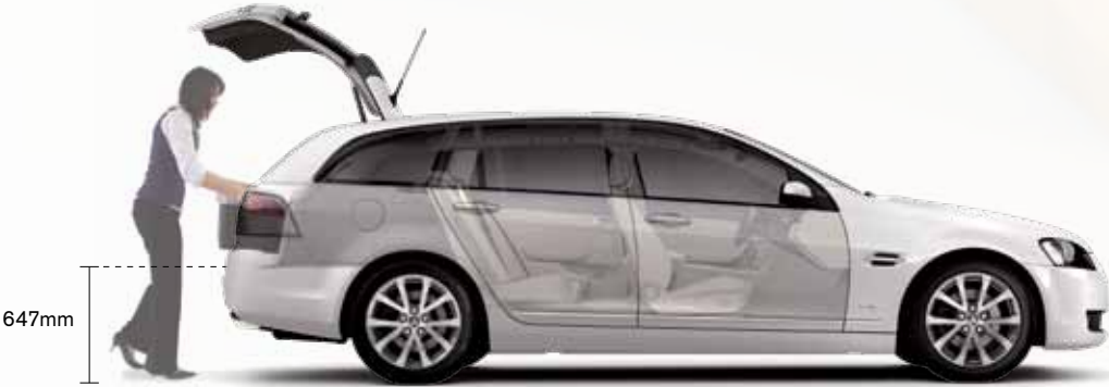
647mm Elevated cargo floor