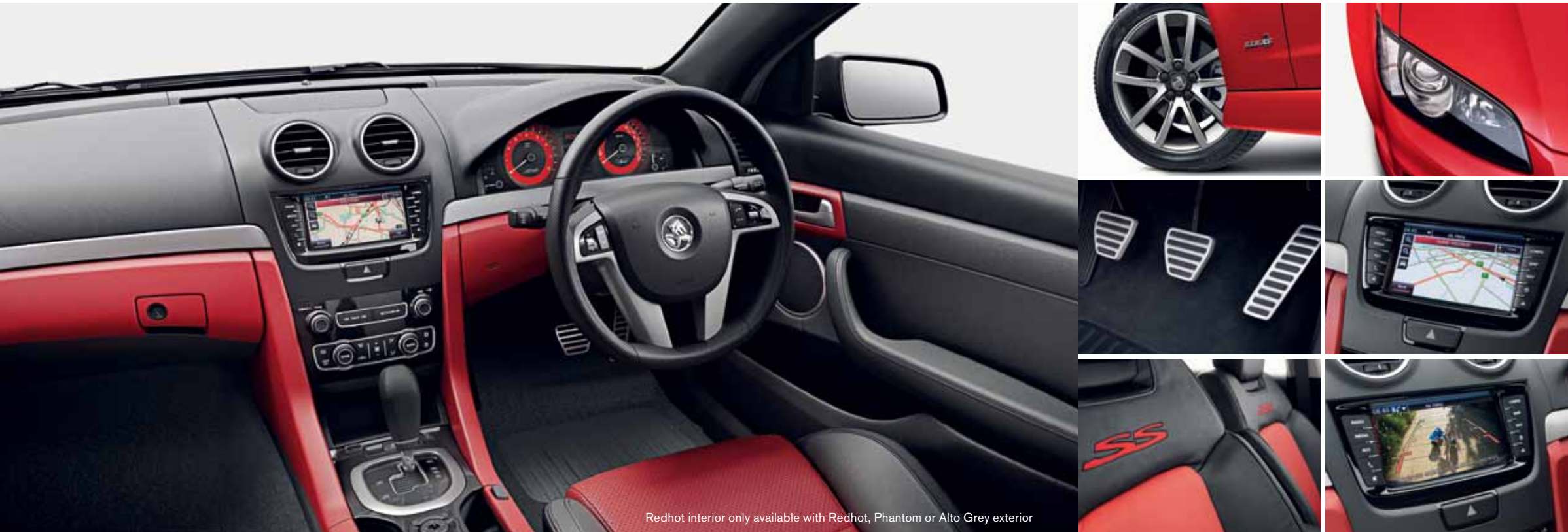
Redhot interior only available with Redhot, Phantom or Alto Grey exterior