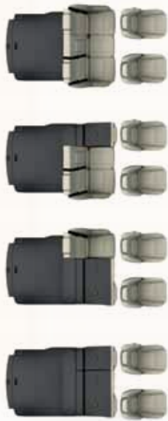
60/40 split rear seating