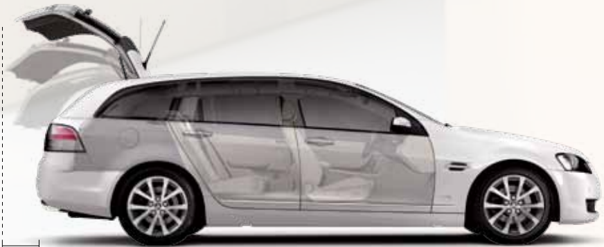
268mm Forward hinged tailgate