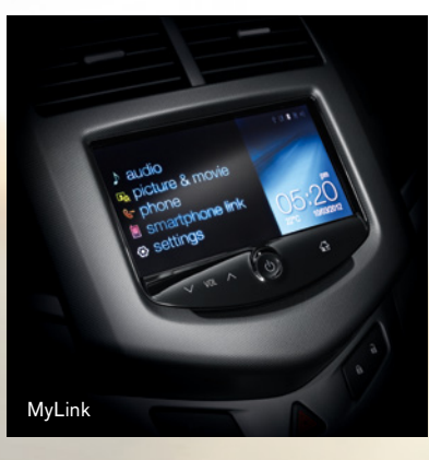
Holden MyLink offers new levels of convenience and flexibility by bringing smartphone capabilities into your vehicle.