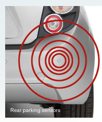
The CDX eases into and out of tight parking spaces, thanks to its rear parking sensors. Audible warnings indicate the proximity of potential obstacles.