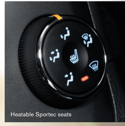
If you hate the cold, you will warm to the idea of electronically heated front seats.